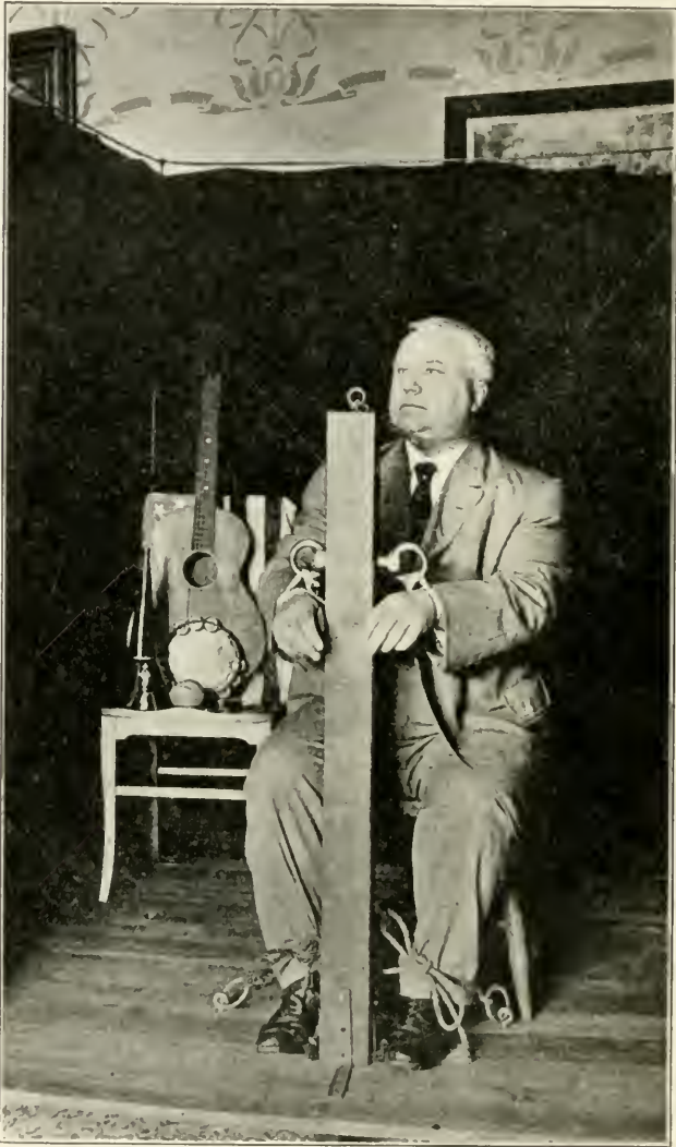
CABINET, PERFORMER, AND APPLIANCES.

In my case I use a cabinet, and the effect is always in proportion to the thoroughness with which the guests or a committee examine everything. So I let them erect the cabinet for me.