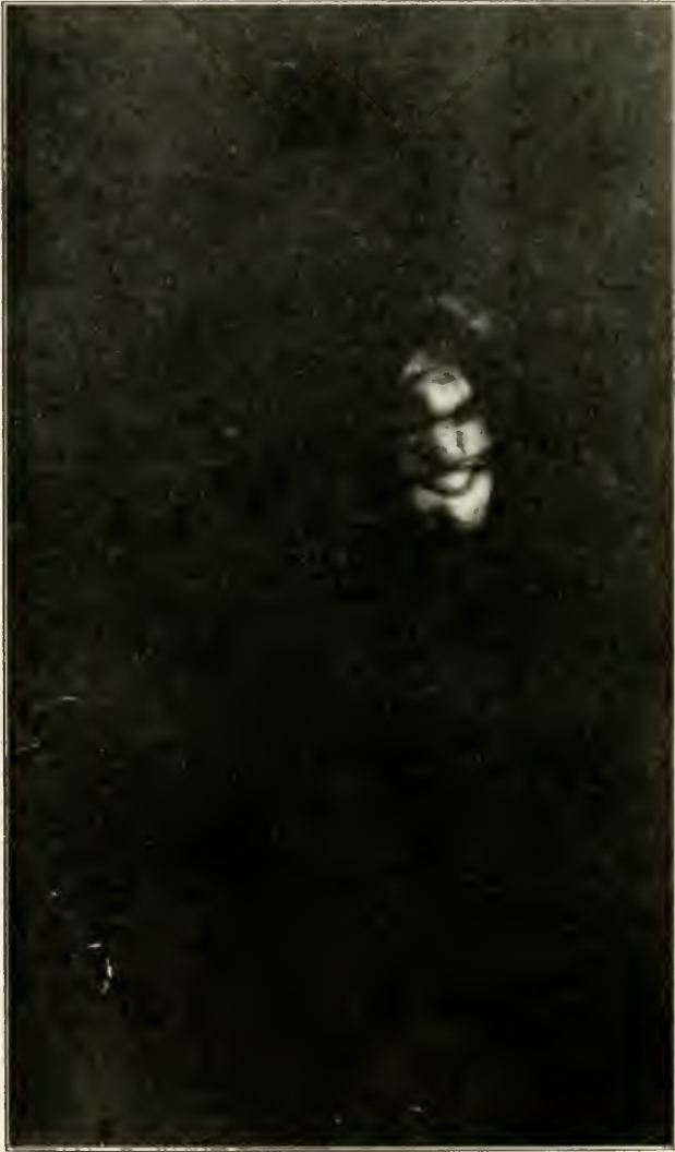
PHOTOGRAPH OF A DIAKKA.

Sometimes ancient personages are materialized. One of these was the materialization of the Witch of Endor. I here reproduce