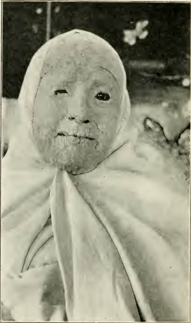
THE SAME WITCH.

ture, brings it into light of day, showing every detail distinctly which, in subdued light, is left largely to the imagination. This,