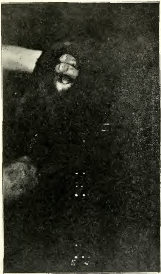
PHOTOGRAPH OF A DIAKKA.

photographs I made of these. The one forming the frontispiece of this number of The Open Court is from the same collection.