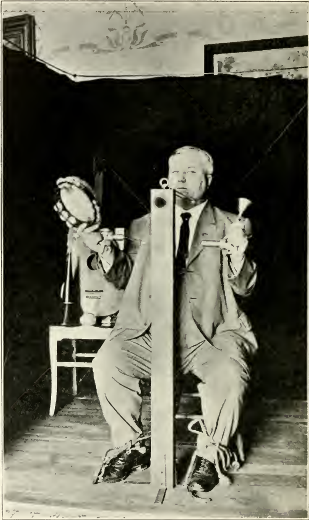
THE BOLT EXPLAINED.

guests and the medium are in the room. The door has never been disturbed.