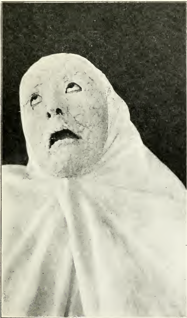
THE SAME WITCH, OTHER POSE.

guests and they hold his hands. At the same time a number of living spirits emerge from the cabinet and move about the room.