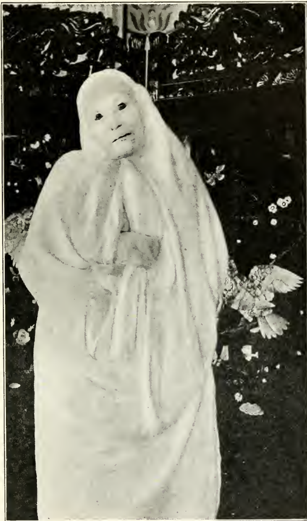
MATERIALIZATION OF AN ANCIENT WITCH.

The awful death-like pallor in the subdued light produces an effect on the weak-nerved that is not for their good. I have seen women