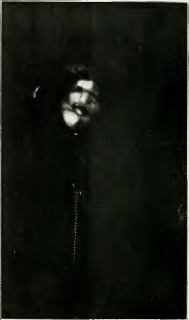
MATERIALIZATION OF A DIAKKA. (From Photograph.)