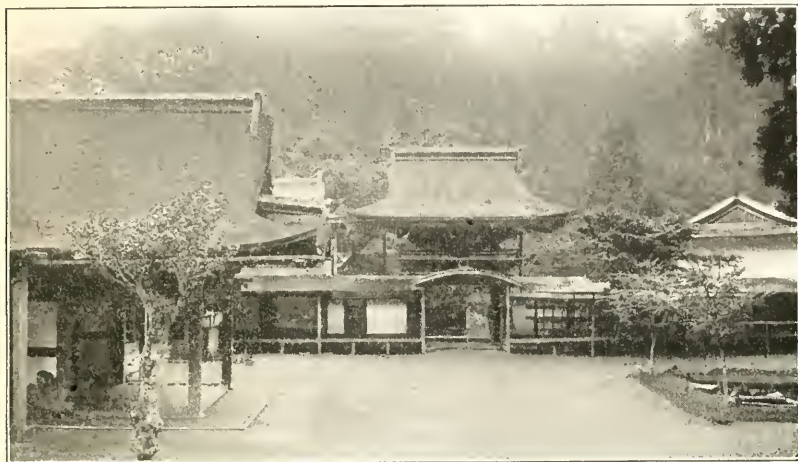
THE KONGO SAMMAI-IN, ONE OF THE OLDEST TEMPLES.

Kobo Daishi, the founder of the monastery, who died in 834