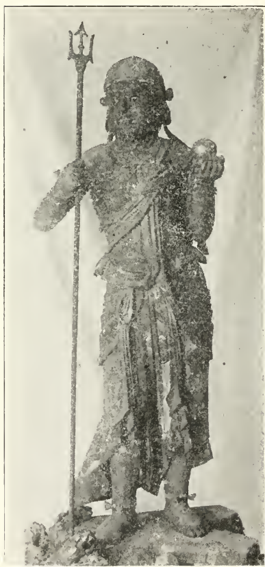
EKI DOJI, one of the eight Great Boys.

Among many objects of worship, which are said to have been carved by the founder of the monastery, there is a small portable shrine, a "National Treasure," known as "makura honzon," makura