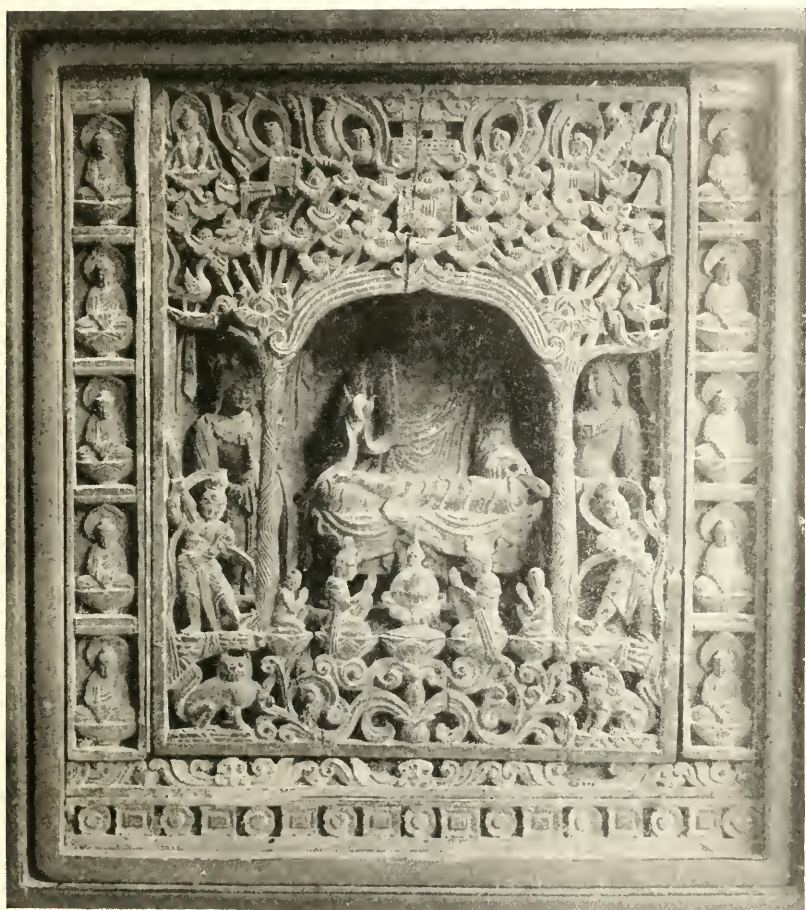
THE MAKURA HONZON AT THE FUMON-IN.

No image of Amida, a powerful deity, the ideal of boundless