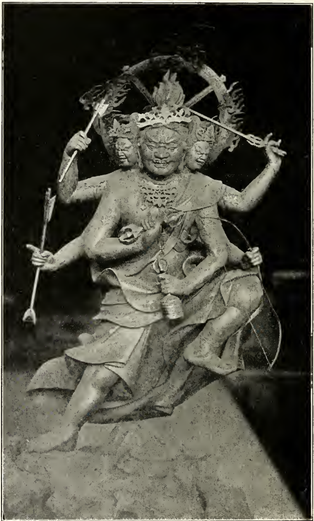
KONGO YOSHA MYO-O, ONE OF THE FIVE GREAT DIVINITIES.

handed wood carver of unusual talent and skill, who died in 1634, Kobo Daishi, even if his life had lasted six hundred years instead of sixty-one, as it actually did, could not have written all the sutras,