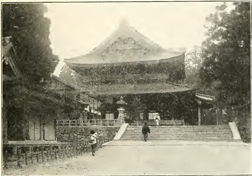
THE KONDO, THE CHIEF SANCTUARY OF KOYASAN.

Beside those above mentioned, there is a large number of splendid wooden sculptures, as the Shingon sect of Buddhism, to which the Koyasan monastery belongs, has given fitting and plastic