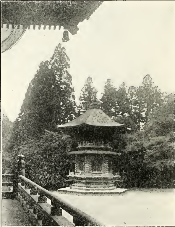
KYŌ-DO, OR SUTRA-BUILDING, A REVOLVING LIBRARY OF SACRED BOOKS.

Treasures" and ascribed to Ono Takamura, a man of letters and artist of high attainment, who died in 852. It is a standing figure with a benevolent countenance holding a staff called shakujo with metal rings attached to the top of it and a jewel, hoju , in his left hand. The jewel represents the bodai-shin , bodai meaning Buddhist knowledge, shin meaning mind: the wish to know the ways of Buddha, the righteous awakening of humanity. The inmost desire, the yearning of the human soul, is kept constantly awake by the