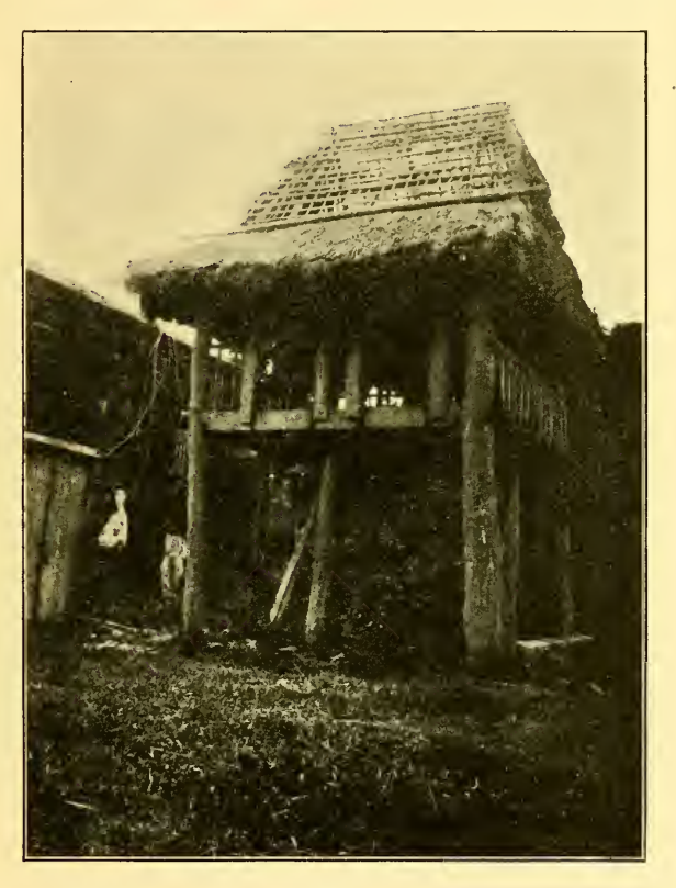
BELL-TOWER OF THE CHURCH OUTSIDE OF THE FORT.

To those of us who lead busy lives in the centers of what we call twentieth-century civilization, life in a place so isolated from the rest of the world as Tay Tay seems impossible. Yet the inhabitants of this barrio are quite contented and fairly comfortable. They live "the simple life" indeed. While their resources are