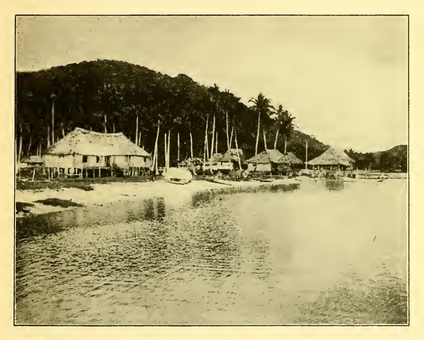
VILLAGE OF TAY TAY FROM THE HARBOR.

Early on the second morning we entered the harbor of the small but ancient village of Tay Tay (pronounced "tie tie" and spelled in various ways) on the eastern shore of Palawan. Not a white man lives in this inaccessible hamlet and it is seldom that one visits