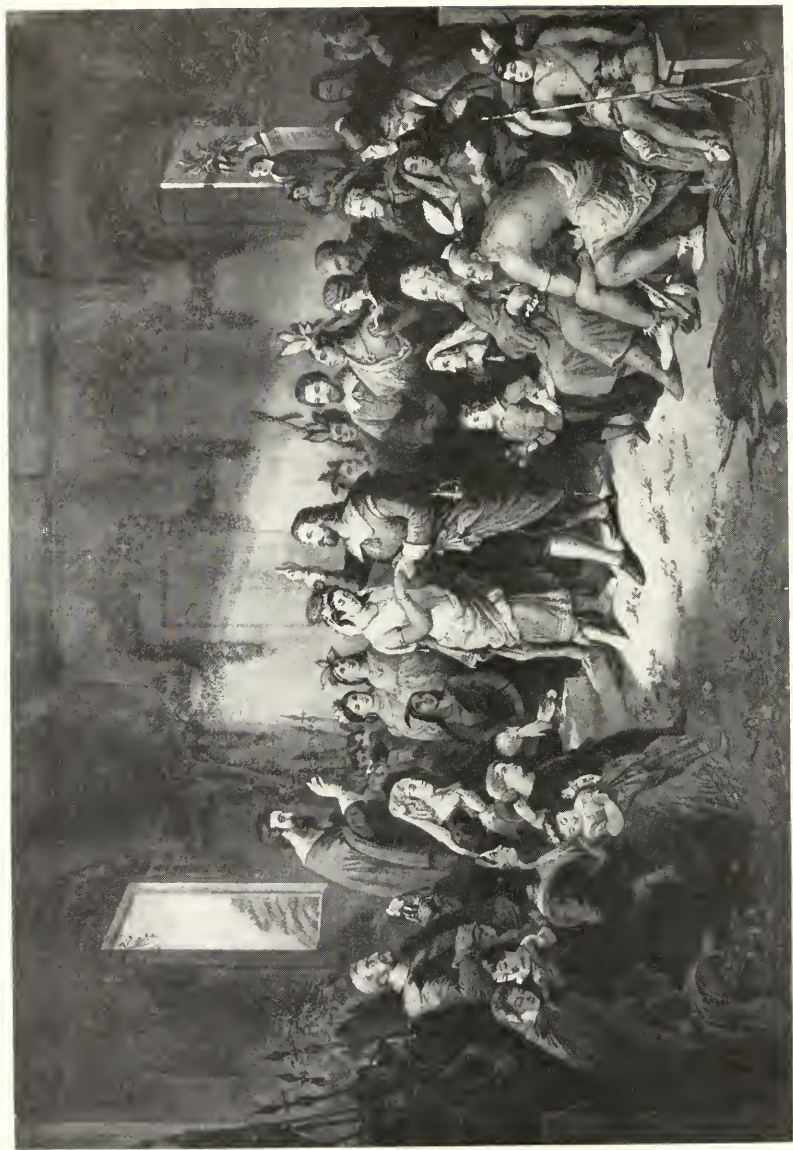
Frontispiece to The Open Court.