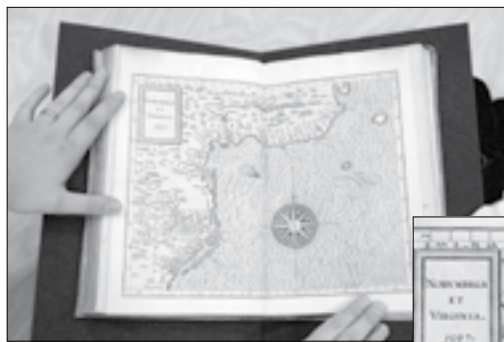
America's East Coast is marked by Virginia and the mythical Norumbega, shown in the inset.

depicting different areas of North, Central and South America, as well as the Caribbean islands. In describing the American portion of the atlas an antiquarian map seller stated, “The great city of ‘Norumbega’, an early New England misconception, is generally thought to represent the Penobscot region in Maine.