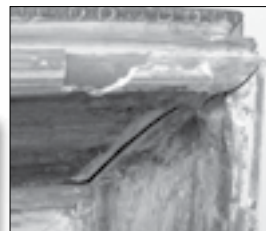
The task of removing the frame’s thick and damaged casein paint was challenging.

casein paint, a milk-based, water-soluble medium often used by artists. He further explained that the original gild had probably “worn off,” due to environmental factors such as cleaning, improper storage, and excessive heat and humidity. Cavanah further suggested that coal soot has particularly invasive properties that “if exposed to such for some years, it becomes next to