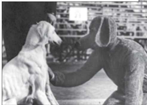
A meeting of mascots seemed to make the canine nervous.