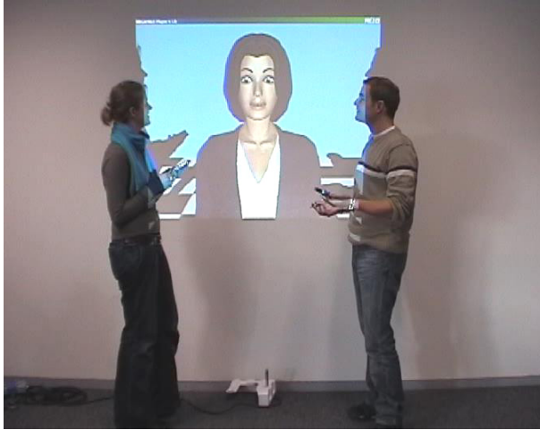
Fig. 1. The setting

has to decide whether to believe the other player's claim. In this case, she has to cast next. Otherwise, the dice are shown and if player 1 has lied he has lost this round and has to start a new one. For the experiment, each player was equipped with a PDA which replaced the cup with the dice in the original game.