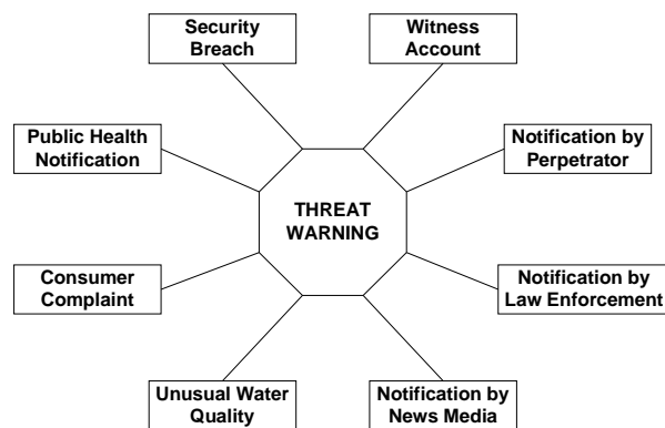
Figure 1. Summary of Threat Warnings

The overall response to a contamination threat is schematically depicted in Figure 2 and indicates two