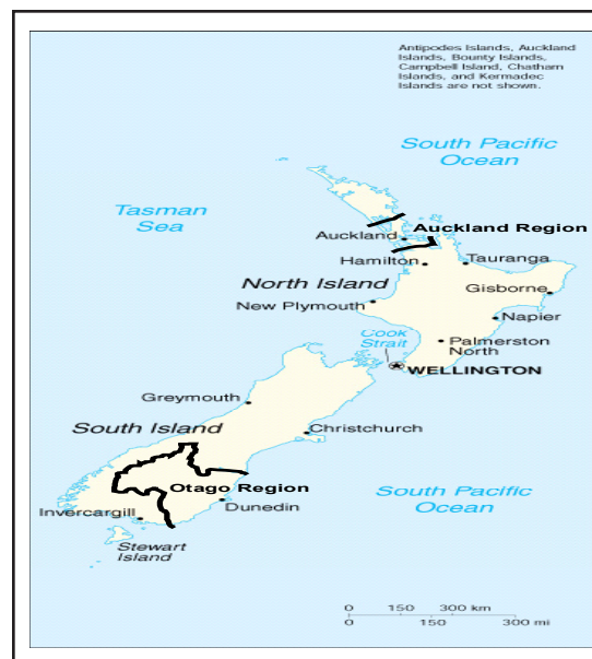
Figure 1. New Zealand and Auckland and Otago Regions.

Implementation of IWRM can take many forms, although there are general pathways it often follows (Lee 1999, Molle 2003). In well functioning systems, IWRM is made of policies with clear objectives that in turn are