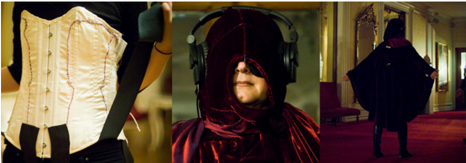
Fig. 2. The bodysuit for the Blind Theater. The haptic suit had two functional layers, one inner corsette and an outer, looser-fit cape.

The next iteration of the system was named 'The Blind Theatre' and turned the body into the stage of a somatic theatre (Fig. 1 and 2). It was performed indoors in 2009 at the Norwegian National Theatre in Oslo 3 . Users experienced an audio-haptic story while walking blindfolded around in the theatre. They reported high-order tactile percepts such as stroking, rubbing and caressing [27].