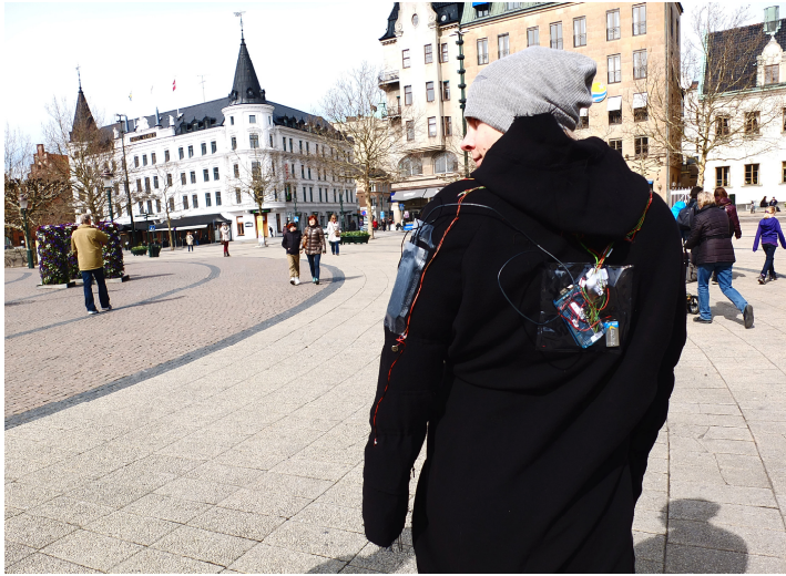
Fig. 4. The Sense Memory Cape during the Malmö test