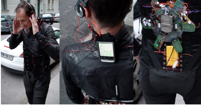
Fig. 3. The Psychoplastic bodysuit during use in Ljubljana 2010

The third iteration of the design replaced the laptop with the use of smartphones. This increased both comfort and maneuverability due to the smartphones weight and small form factor.