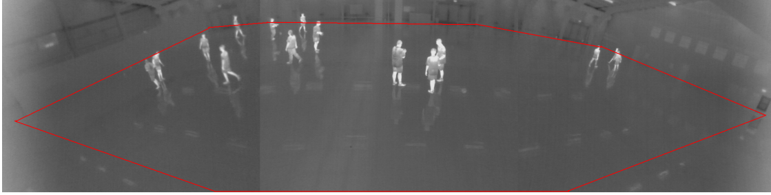
Figure 5. Example of the thermal image, with the outline of the court drawn as a red line.