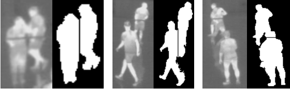
Figure 2. Examples of wide and tall blobs that have been split.

this type of occlusion, it is often possible to see the head of each person, and split the blob based on the head positions. Since the head is more narrow than the body, people can be separated by splitting vertically from the minimum points of the upper edge of a blob. These points can be found by analysing the convex hull and finding the convexity defects of the blob. See examples in figure 2.