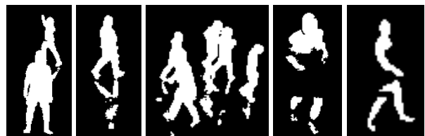
Figure 1. Examples of the challenges for detection of people.

used in previous research in sports analysis [1, 22, 12, 40], a general public acceptance of more permanent installations in such facilities are harder to come by due to privacy issues. We therefore apply thermal imagery, which captures the infrared radiation instead of visible light, and creates an image whose pixel values represent temperature. People can not be identified in thermal images, thereby eliminating the privacy issues. A positive side effect of thermal imaging is that detection can often be reduced to a trivial task. However, thermal imaging also introduces new problems, as people are often fragmented into small parts, and reflections can be seen in the floor. Moreover, the challenges of occlusions remain in thermal images, see figure 1.