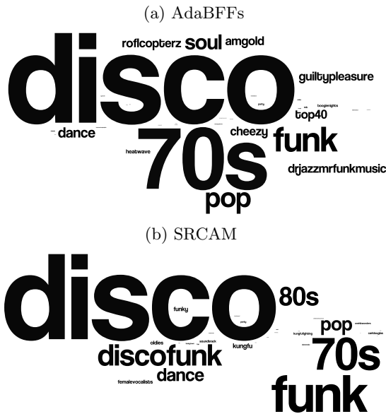
Figure 3: Wordle of last.fm tags applied to Disco excerpts of (top) CPMs of AdaBFFs (15, 28, 67, 83), and (bottom) SRCAM (42, 48, 53, 64, 79).

Figure 3 shows a graphic representation of all tags applied by users of last.fm to these excerpts. The font size of each tag is proportional to the “count” supplied by last.fm (100 is the most frequent, and 1 the least frequent). From this we see the most frequent tag of these CPM excerpts is disco. Looking outside of the Disco data, AdaBFFs and SRCAM also consistently and persistently mislabel as Disco other excerpts. In Table 1, we see how both AdaBFFs and SRCAM consistently and persistently label as Disco, “Honky Tonk Woman” by The Rolling Stones, and “Looking for the Perfect Beat” by Afrika Bambaata.