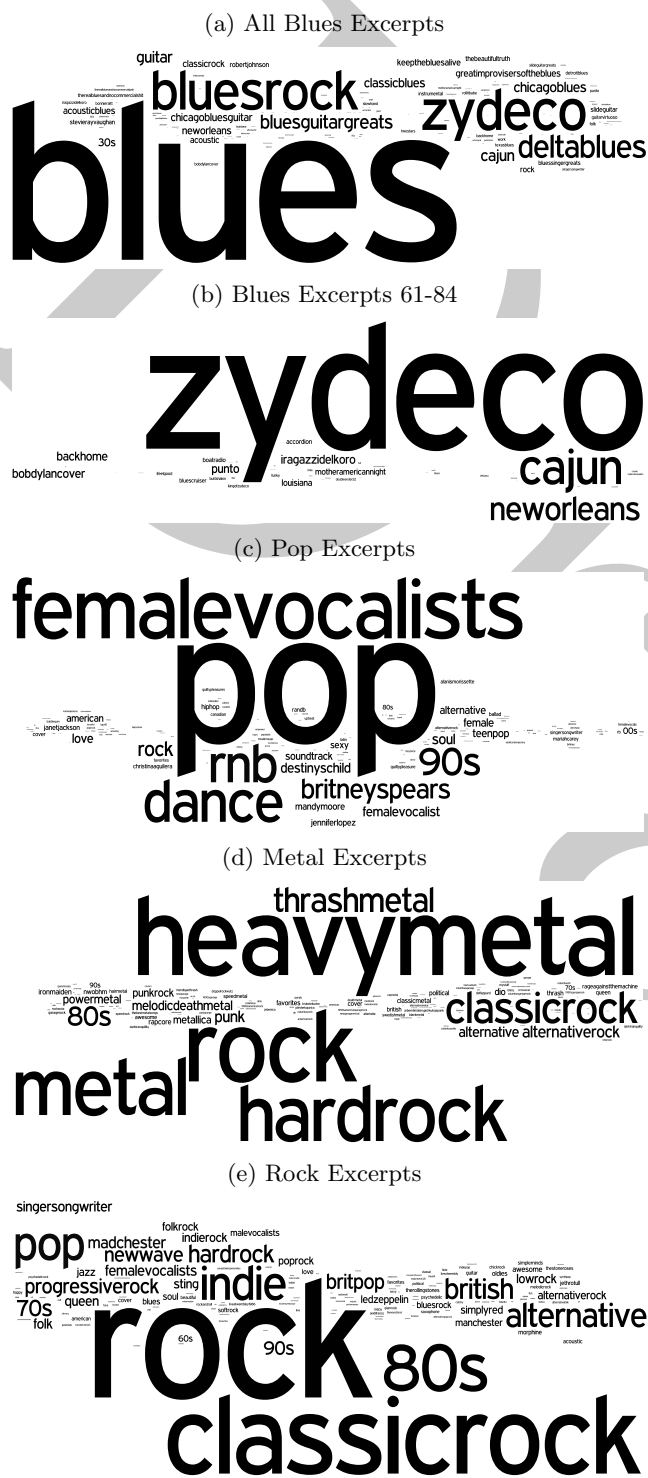
Figure 2: Last.fm tag wordles of GTZAN excerpts.

Of the Metal excerpts, we find 8 exact replicas, and 2 versions. Twelve excerpts are by The New Bomb Turks, which last.fm users tag most often with “punk, punk rock, garage punk, garage rock.” And 6 excerpts are by Living Colour and Rage Against the Machine, both of whom are most of ten tagged on last.fm as “rock.” Thus, we argue that these 18 excerpts are conspicuously labeled as Metal. Figure 2(d) shows that the tags applied by last.fm users to the identified excerpts labeled Metal cover a variety of styles, including