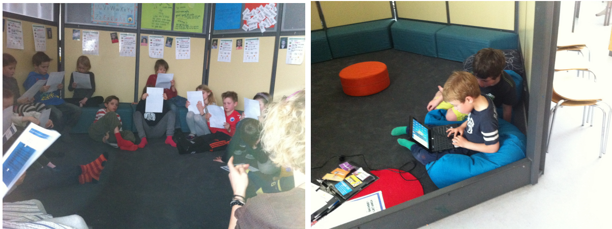
Figure 2: the students read the process description and their learning objective contract on paper and work in pairs with their assignment on the Notebook

My Shop progresses as illustrated in figure 1. Each day commences with a plenary session where the tasks for the day are discussed: How far have the students got? and What is important? The first day is about establishing ownership of the process and introduces the mathematical language and concepts. Together, the class agrees on the framework for the product and the learning objectives (Fig. 2). These agreements are written in the students’ learning objective contract. Midway through the iterative production process, the students are at the helm, while the teacher checks whether “all bases have been covered”. At the end, the assignments are collected on the class intranet so that everyone can try each other’s assignments. The students were allowed to pick the shop’s specialty themselves. This results in a wide array ranging from pets to footballers, from sweets to supermarkets and cafes.