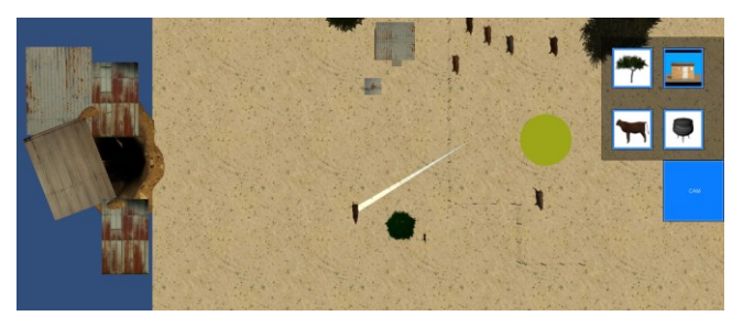
Figure 1 - a screenshot from the Homestead Creator interface captured from a top-down camera in the scene. The graphical metaphor for deletion of objects is located to the left.

expand' or boxes with text in to be a button etc. Thus we first attempt to map traditional desktop icons or functions to a set of culturally derived metaphors. Heukelman's research on designing cultural interfaces [3] inspired us to look for an important user action; e.g. the deletion of virtual objects in the 3D world. Another member of the research team, originating from the village has close to his house in the village a hole in the ground to dispose garbage in. It is partly covered with worn metal plates to support the sides of the hole, and immediately attracted our attention as the metaphor we are seeking. If a user drags an object into the garbage hole, the object is removed from the terrain (see figure 1).