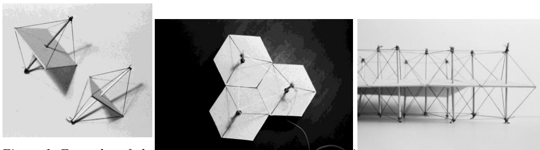
Figure 1: Examples of plate tensegrity units; different plate simplex types (left and centre) and a side view of an assembly showing the middle platelayer inscribed by cable-nets (right).

A plate based tensegrity structure [1,2] is composed of small plates of various shapes, e.g. triangular, square or hexagonal, which are connected along their edges to form two- and three-dimensional assemblies, see Figure 1, left and middle. Plate tensegrity is based on panels of cross-laminated timber, CLT, and utilises the high strength to weight ratio and workability of these layered timber products. To increase the structural depth, each plate is perforated by a single strut, oriented normal to the plate. The ends of the strut are connected to the corners of the plate by cables. Finally, the ends of the struts are connected by cables to neighbouring struts. The resulting triple-layer structure, to the right in Figure 1, shares many similarities with double-layer grids, especially the cable-strut grids by Wang [3] and triple-layer tensegric strut units by Saitoh [4,5]; Saitoh introduced a central strut in a wire-wheel configuration and uses classification principles based on the arrangements and resisting mechanisms of tension members in a bar frame. The main difference, however, is the middle platelayer, which functions as shear stiffening roof covering. It should be noted that Skelton refers to tensegrity plates, but then as an analogy considering an assembly of strut-based simplexes in a flat configuration [6] and not as an actual case of an integrated structural plate.