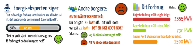
Figure 3. Messages in Power Advisor.

Power Advisor integrates personalized information for the user through a messaging service. All messages are placed in the Inbox and we use three different types of persuasive messages– (i) expert advice, (ii) community behaviour, and (iii) personal consumption performance.