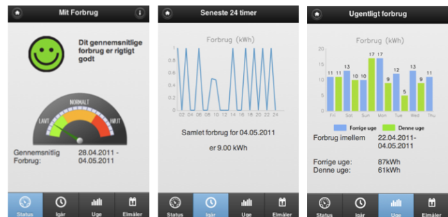
Figure 2. Three views on power consumption namely last week (injunction), last week consumption (descriptive), and last week compared to the week before (descriptive).

The first view visualizes the total household power usage (measured as kilowatt hour) for the last week compared to the average consumption rate for a similar household in the northern part of Denmark (figure 2, left). The assessment shows whether their consumption is low, average, or high and the inclusion of a smiley supports the assessment – as suggested by [18]. The second view shows household consumption over the last 24 hours (with one measurement every hour). This is visualized as a graph (see figure 2, middle). The third view shows consumption per day for the last week compared to the week before (inspired by [22] and shown in figure 2, right). The fourth view (not shown in figure 2) displays the last meter reading. Thus, Power Advisor seeks to provide different kinds of information for assessing one’s own power consumption.