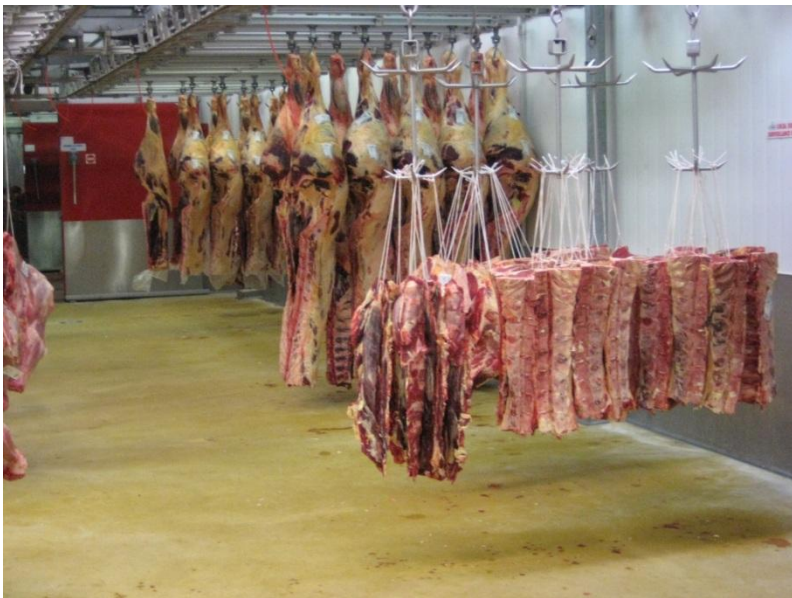
Photo from the Carcass Meat pavilion at Rungis May 11th 2011