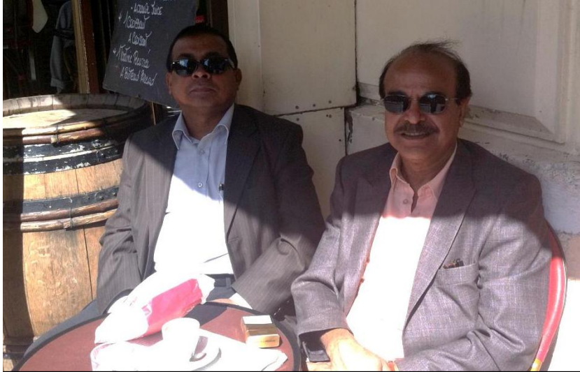
Photo at café in Paris May 12 th . 2011

An example of consisting characteristics is the tendency to speak with other guests at cafés and restaurants. During the coffee break all of the researchers was approached by a man sitting at the table