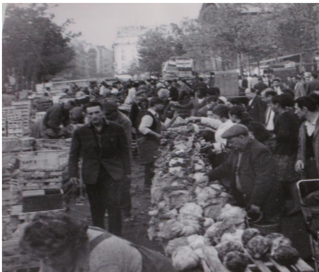
Photo of a picture of Les Halles, selling vegetables, hanging on the wall in a Greengrocer in Paris, May 12 th 2011. (Original date and year unknown)

Rungis is situated just outside of Paris in close proximity to a main road, rail and air routes. It is a large area, over 200 hectares, where different pavilions sell different food and non-food products. Rungis hasn't always been placed in its current position, outside of Paris. The history of Rungis goes back to 1110 AD where a food market was established in Paris. It was known as "Les Halles" and since then it has evolved and been renovated many times by among others Emperor Napoleon I. In 1969 the food market officially opened in the landscape of Rungis ( www.rungismarket.com ). This report is based on a visit at Rungis in May 2011, four of the five different types of pavilions were visited: Fish and seafood, Meat, Dairy and delicatessen and finally the Fruit and vegetable pavilion. The only pavilion not visited was the Flower and plants pavilion, due to lack of relevance to the foodscapes perspective.