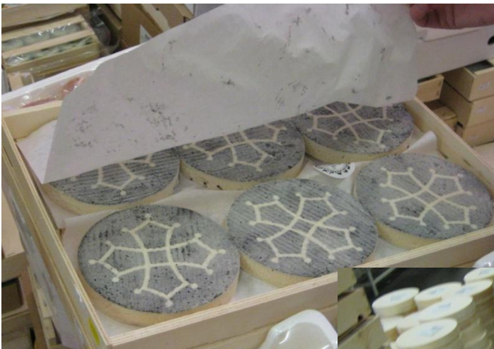
Photos from the Dairy and Delicatessen pavilion at Rungis May 11 th 2011

itself. Represented both by the bike, the music the somehow more ‘messy’ way of arranging and displaying the ‘foodstuff’, the contradiction emerged, drawing the researchers attention to food discourses stereotypes and food-shaped identity. In this