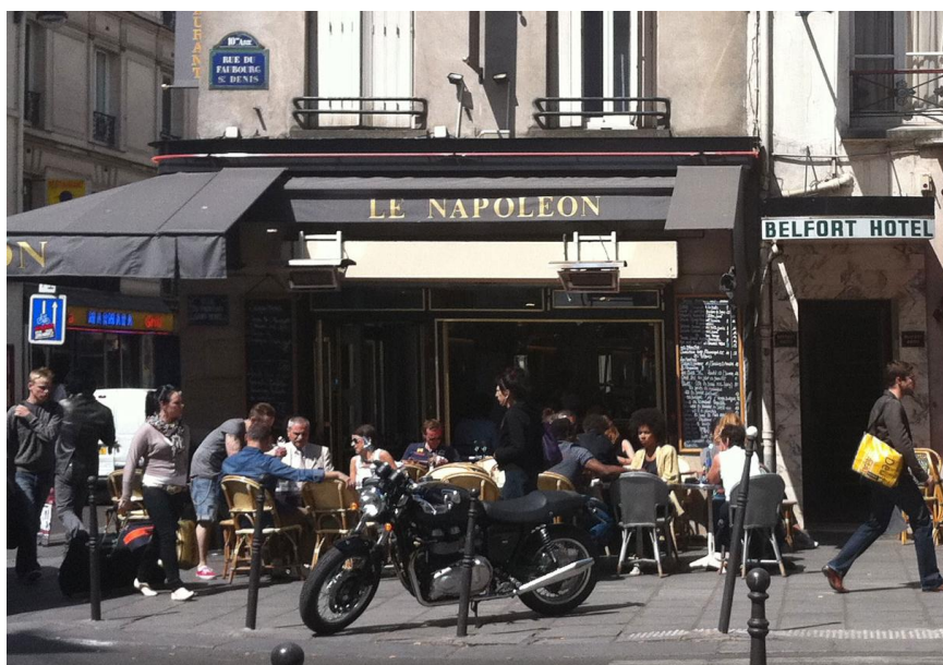
Photo of the Café Le Napoleon May 12 th 2011

multiplicity of matters makes the researchers recognise it as a foodscape.