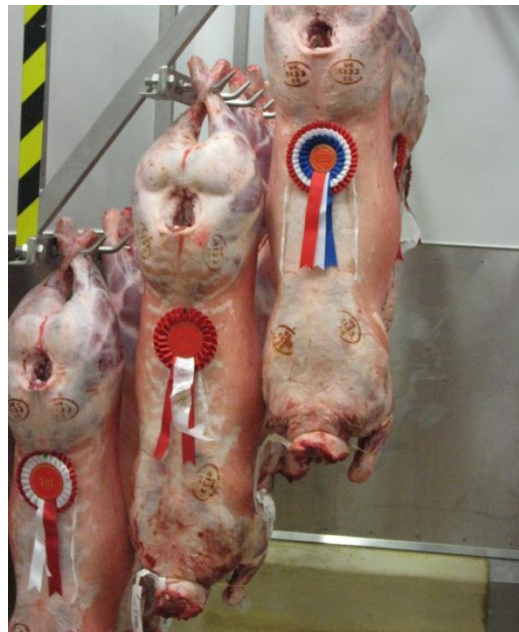
Photo from the Carcass Meat pavilion at Rungis May 11 th .2011

Whilst in the 3 rd arr. when observing a truck driver delivering meat to a restaurant, the handling didn’t seem as respectful when carrying the meat from the truck to the restaurant. When he saw the researchers showing interest in his activities and taking pictures, he got extremely mad and yelled. Due to ethics the researchers figured it was correct to delete the pictures, since it might catch him in doing something wrong. To Danish standards it didn’t seem like the truck was qualified to transportation of raw meat.