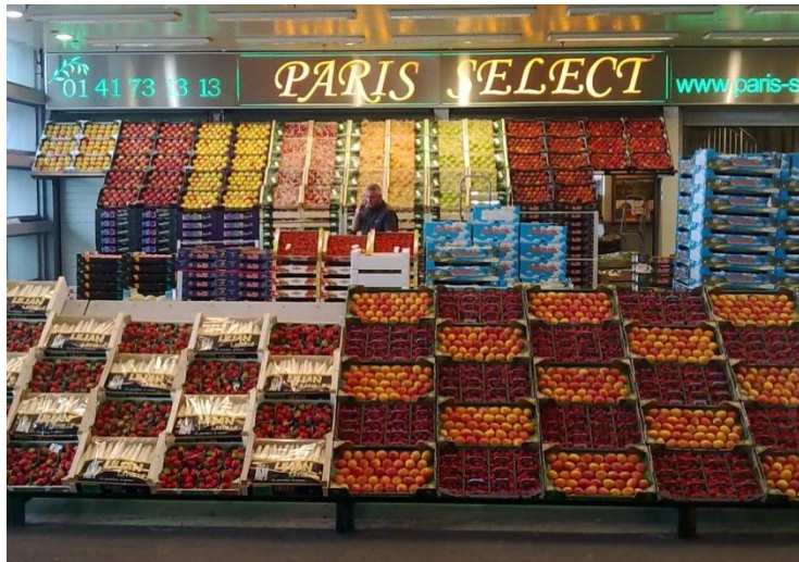
Photo to the left: Fruit and vegetable pavilion at Rungis, May 11 th 2011.