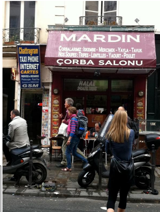
Photo of Middle-Eastern eatery in Paris May 12 th 2011