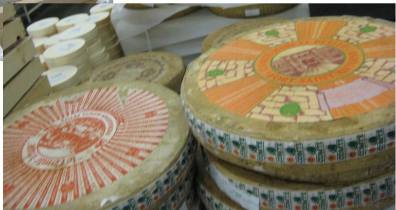
Colourful decorated and carved cheese crusts.