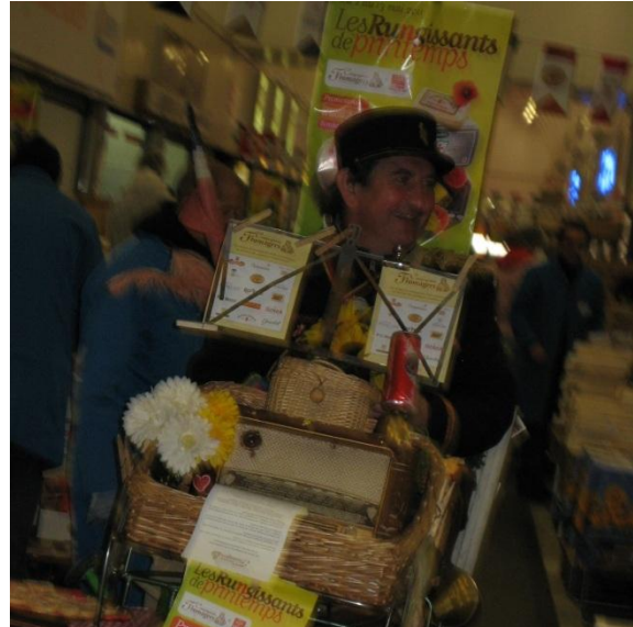
Photo from the Dairy and Delicatessen pavilion at Rungis May 11 th 2011

At Rungis the same multiplicity occurred in the Dairy and Delicatessen pavilion that seemed very relaxed and comfortable. There was a special “feel good” atmosphere, which was manifested by, a man who can be described as a character on a bike playing music, cheese taste samples, wooden boxes with dairy products, decorated cheese crusts, posters and pictures, the business names signs spelled in neon, altogether leaving the surroundings in a good ambience. But it is not in the Dairy and Delicatessen pavilion itself a foodscape is created. The atmosphere of the dairy and cheese pavilion affected the researchers by associating the foods in the pavilion with more happiness and feeling more pleasurable than in the other pavilions – meaning the sum of interactions - the foodscape affected the researchers and their individual food discourses. It was exactly due to the contrast in surroundings: the high focus on hygiene in the other pavilions, the coldness in the meat and fish pavilions, the neatness in the fruit, that the causality of the Dairy and Delicatessen, illuminated