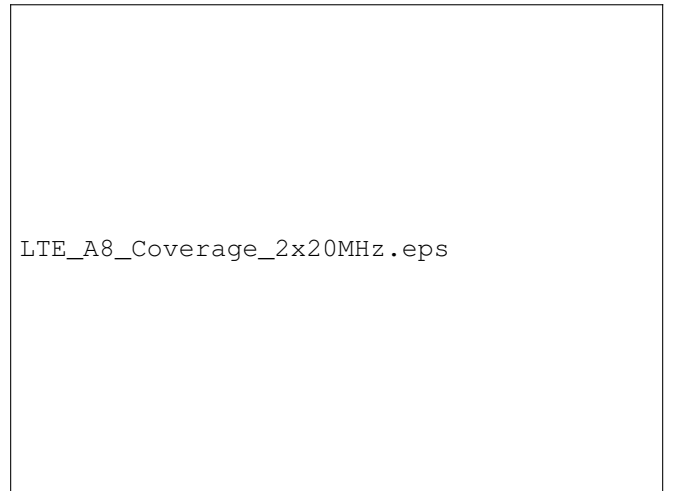
Fig. 3. 5%-ile (coverage) user throughput and the gain in the coverage throughput of MIMO UEs over that of SIMO UEs

2) User throughput performances: Figure 3 illustrates the 5%-ile user throughput obtained in 2x2 MIMO system and its gain over that of SIMO system. The performance of both LTE-Rel'8 and LTE-Advanced UEs are shown on the same figure. From low to medium traffic load the gain in the 5%-ile is flat with an average value of 25% for LTE-Advanced UEs. For LTE-Rel'8 UEs, the gain is reduced from 25 % to 0%. A steady increase in the gain at higher traffic loads is observed for both types of the UE.