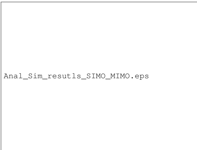
Fig. 5. Simulation and analytical results on the average user throughput of SIMO and MIMO systems

In Figure 5 we compare the user throughput performance obtained from the simulation and from the analytical results. There is a good match between the analytical and simulated results. The difference between the analytical user throughput of the MIMO system and the simulated one is in the order of 10% only. These discrepancies could be due to the limitations in the modeling of the bursty traffic network as well as the simplification in estimating the average user throughput e.g. eq. (6) and eq. (8). Nevertheless, it is shown that the analytical model is capable of capturing the principle behaviors of SIMO and MIMO systems in a bursty traffic network.