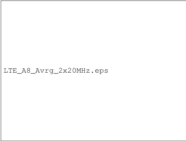
Fig. 4. Average UE throughput and the gain in the average throughput of MIMO UEs over that of SIMO UEs

Figure 4 shows the absolute value of the average user throughput experienced at the MIMO UEs in LTE-Rel'8 and LTE-Advanced systems vs. the offered load. The gain of the MIMO system over SIMO system corresponding to different offered loads is also shown in the same figure. The gain first decreases as the offered load increases as expected. It somehow saturates at the medium offered load and steadily increases at high load. The boost in the gain of the MIMO system over SIMO system at high traffic load is due to the larger bandwidth resource available for the MIMO UEs as described in Section III-B1.