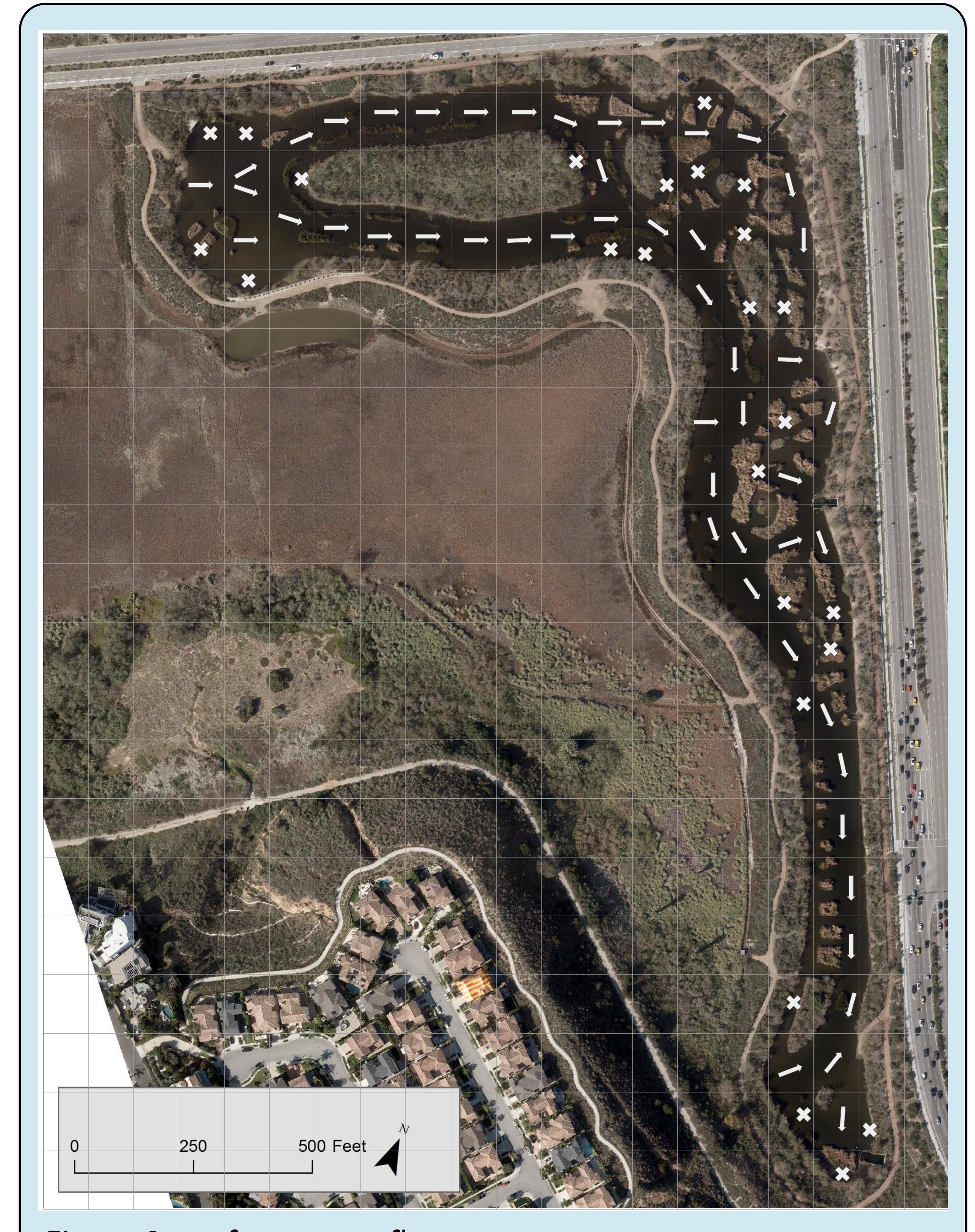
Figure 2: surface water flow map

The study obtained a map from the Ballona Wetlands Conservancy which created the image through satellite data in order to have a highly accurate picture of the Ballona Freshwater Marsh. Grid lines were added to the map with width and height corresponding to around 100 feet square to give perspective and delineate where arrows for surface water flow would be inserted (Figure 2). The arrows represent areas where the surface water flow was highest in the marsh, and the x marks represent where water flow was stagnant or essentially not moving.