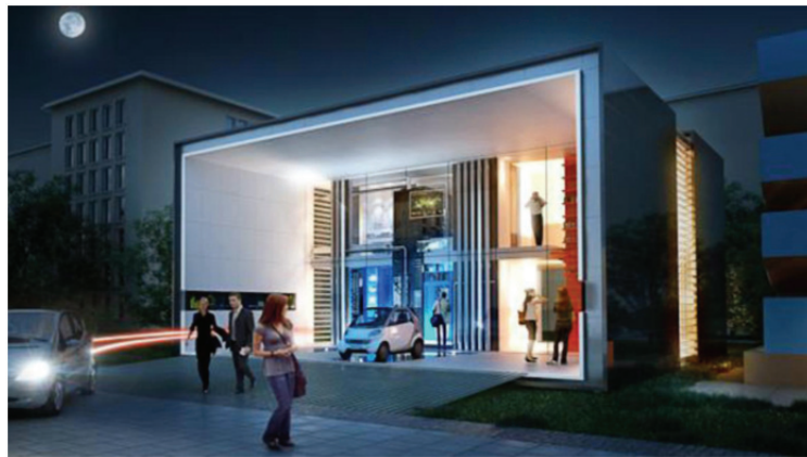
Figure 2. Design of the energy surplus house currently under construction in Berlin.

Cologne. The buildings realise different energy concepts for achieving the energy surplus house standard.