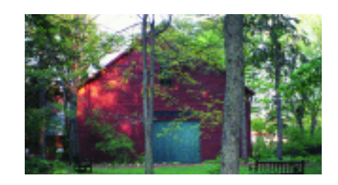
McLaughlin Garden and House, 1840's, South Paris, farmstead and two acre perennial garden begun in 1936.