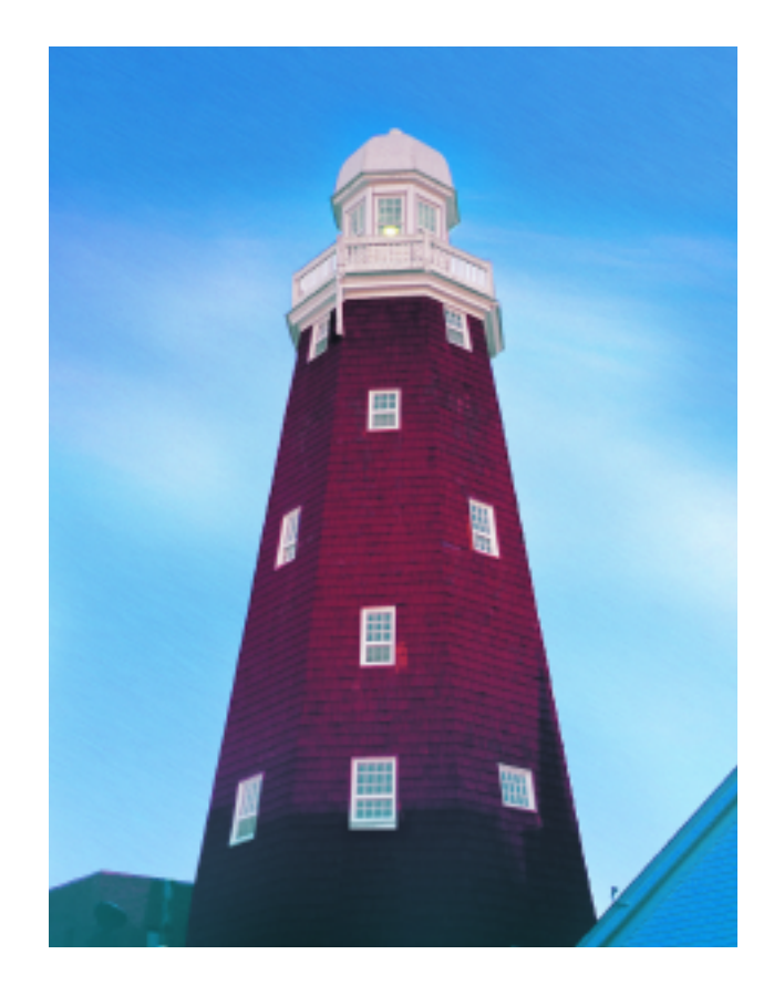
Maine Architecture Trail