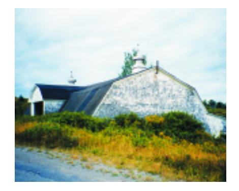
Potato barn, 1940, Fort Kent.

While potato barns are found throughout Aroostook County, a particularly large number of them are on the back roads between Presque Isle, Caribou and Fort Fairfield.