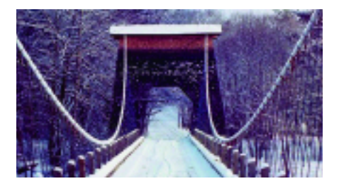
New Portland Wire Bridge,1842, New Portland.