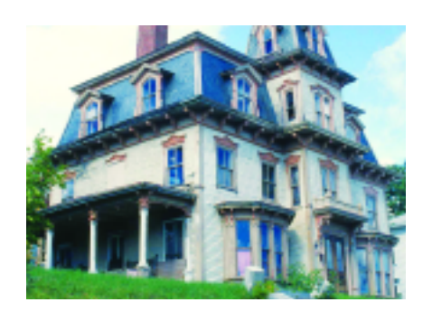
Governor Joseph R. Bodwell House, c. 1875, Hallowell Historic District.