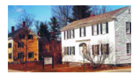
Dr. Moses Mason House, 1813, Bethel, owned by the Bethel Historical Society.