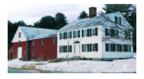
Moses Hutchins House, c. 1839, Lovell, home to the Lovell Historical Society.

Hemlock Covered Bridge, 1857, Hemlock Bridge Road, East Fryeburg. Built with the Paddleford truss design, this bridge is the oldest of this type in Maine.