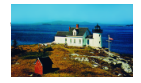
Pumpkin Island Light, 1854, Eggemoggin vicinity, Deer Isle.