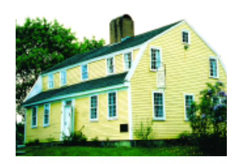
Burnham Tavern, 1770, Machias.