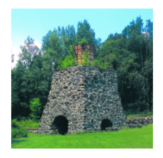
Katahdin Iron WorksA restored stone blast furnace and charcoal kiln on the site of a 19th century iron works that produced 18-20 tons of raw iron daily during its periods of peak operation in the 1880s.

Shaker Museum , 707 Shaker Rd., New Gloucester, ME 04260, 207-926-4597, www.shaker.lib.me.us.Located in the last active and functioning Shaker community in the world.