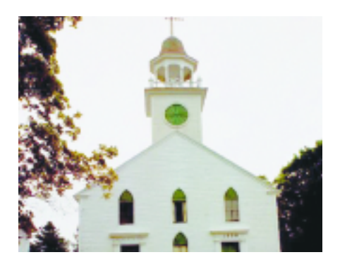
Bingham Free Meeting House, 1836, Bingham.