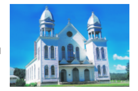
L'Association Culturelle et Historique du Mont-Carmel, 1909, Lille.