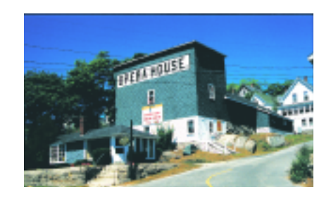
Stonington Opera House, 1912, Stonington.