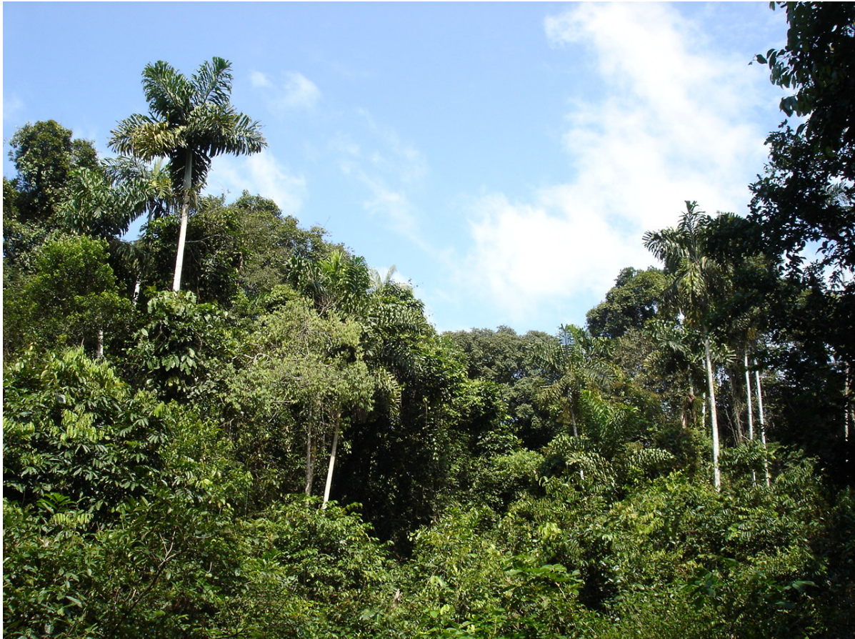
Figure 2. Theme 2 focused on the importance of the climate-biodiversity relationship, not just for nature conservation, but also for the future climate itself. Notably, forest conservation including Reduced Emissions from Deforestation and Degradation (REDD) represents a major and cost-effective climate change mitigation opportunity. One of the key points mentioned in the statement was that biodiversity needs to be an integrated part of the general climate change mitigation and adaptation efforts.

reserve systems, designing reserve systems that are resilient to climate change, climate change-off-setting local management (controlled burning to reduce fuel loads etc.), captive breeding, assisted migration (translocation), engineering new habitats etc. [9, 10, 11, 12].