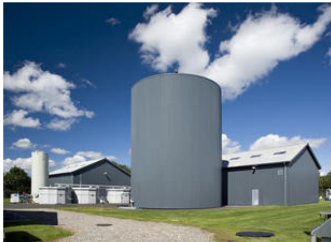
Figure 4. A picture of the worlds largest experimental biogas plant, situated at Research Centre Foulum, Aarhus University.

The greatest challenge facing agriculture during the 21 st century is probably how to feed the increasing not only an increasing population, but also an increasing number of more wealthy people on the Earth, while maintaining high-quality soil and water resources [27]. Climate change significantly adds to this challenge by reducing the quality of soils and the availability of water in many regions through the increasing variability in temperature and rainfall [28]. The already large contribution of agriculture to global greenhouse gas emissions will increase unless more effective and climate-friendly farming systems are adopted [9].