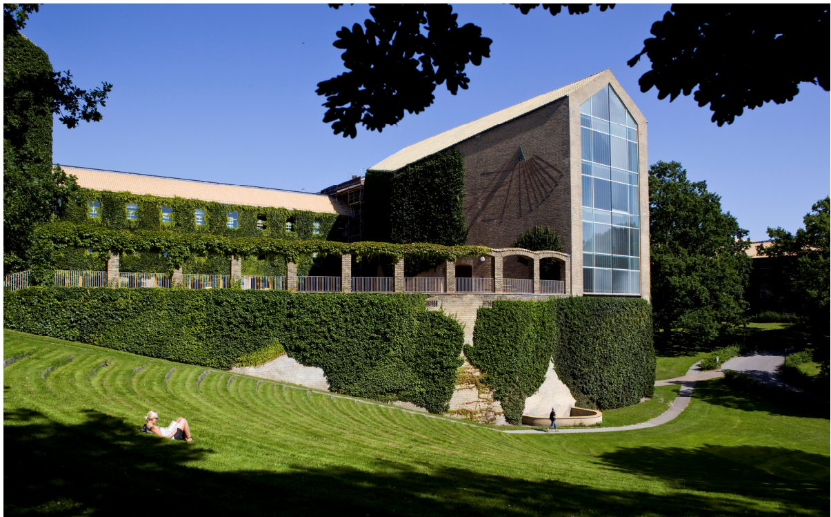
Figure 6. The Aarhus University campus.