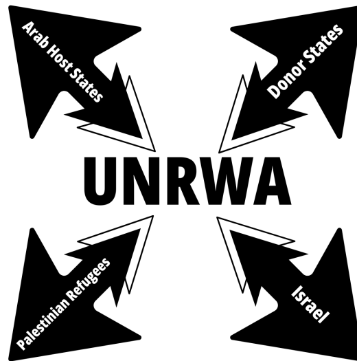
Figure 3: Four forces impacting UNRWA.