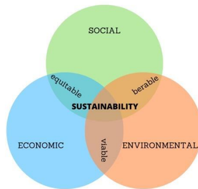
Figure 1. Dimensions of sustainability

The social dimension focuses on aspects of equity, accessibility, participation, security and institutional stability (Kim, 2018). Finally, the environmental dimension refers to the natural environment and how it remains productive and resilient to sustain human life; that is, it requires that the resources be used at a rate no greater than that of regeneration, and that the waste it receives be emitted no faster than it can be assimilated (Choi & Ng, 2011; ONU, 1997).