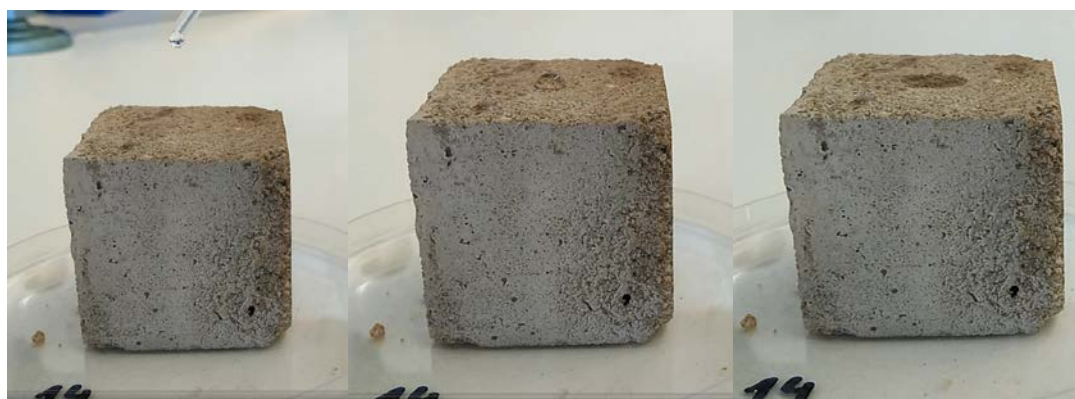
Figure 1. Steps of water drop absorption test.

Five days after the treatment, the repairing effect was assessed by a water-drop absorption test. This test allows evaluating the permeability variation of biotreated surfaces by monitoring the rate of absorption of a 0.1 cm 3 drop of water, that is, the time required for a material to fully absorb a water drop under open air conditions (Figure 1). The absorption period of time was video-recorded.