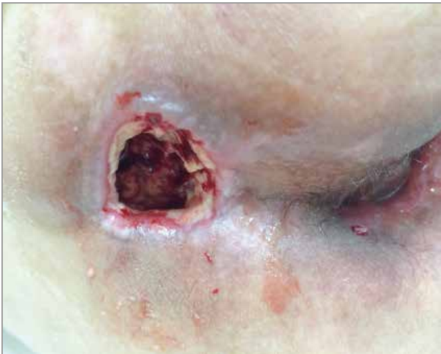
Figure 4. Wound healing by second intention one month postoperatively.

with wide debridement of devitalized tissue, perianal abscess drainage, and transversostomy (Figures 2 and 3). The patient returned to the operating room 11 days after his first radical neorectomy, for further transanal drainage. Two days after the second operation, he developed a complication; decompensated adhesive ileus, requiring laparotomy. Intraoperatively, we found gastric distension with 2 L of gastric contents, which was aspirated. Thin intestinal convolutions were adhered in three regions in the left inguinal canal, in proximity to the sigmoid colon. After adhesiolysis and suturing, abdominal lavage was performed, followed by an appendectomy and drain placement. The incision was closed with a running suture. Next, the perianal region was addressed and a neorectomy and dressing replacement were performed. The patient was discharged approximately one month later (Figure 4). Wound cultures taken the day after the first