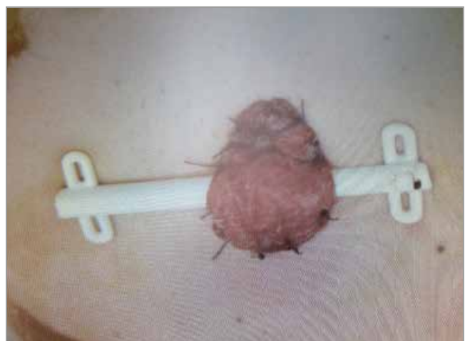
Figure 3. Protective transversostomy.