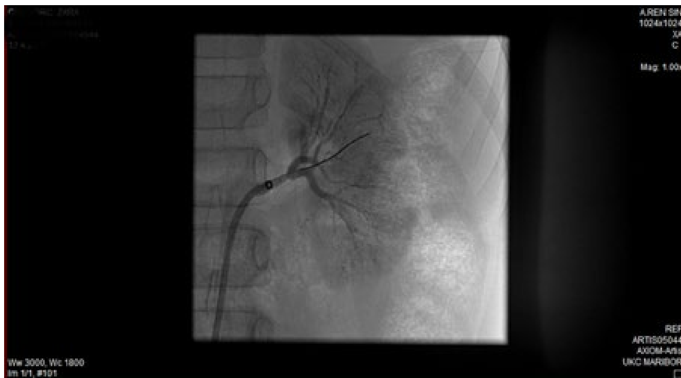
Figure 1b. Conventional renal angiography showing stenosis of the distal part of the left renal artery dilated with PTA, as well as diffuse medium-sized vessel changes, typical for PAN.

In addition, milder changes in the vessels of the right kidney, as well as in hepatic arteries, have been detected with a Doppler scan of the abdominal arteries. MRA of the brain vessels was normal and there were no obvious changes in the large arteries. The patient was then diagnosed with vasculitis of medium-sized vessels, with FSGS and hypertension as secondary events. Genetic analysis of the CECR1 gene (encoding adenosine deaminase 2 enzyme) was negative. Treatment with methylprednisolone (8 mg every 8 h) in combination with MMF (500 mg twice a day) was introduced, according to the ongoing MYPAN (mycophenolate mofetil for PAN) study. Esomeprazole, calcium carbonate, and calcitriol were also administered. High values of BP were measured during the next few weeks, and a noticeable drop in BP occurred only after the combination of these four medications was introduced. After six weeks of therapy, the dose of methylprednisolone was tapered slowly, as BP remained significantly elevated and the patient exhibited a Cushingoid appearance. Acetylsalicylic acid at a dose of 50 mg was also administered. After BP normalisation, the patient felt well and physical examination