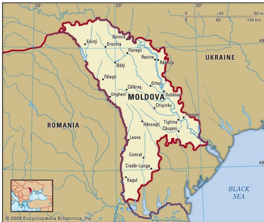
Figure 2. Map of Moldova