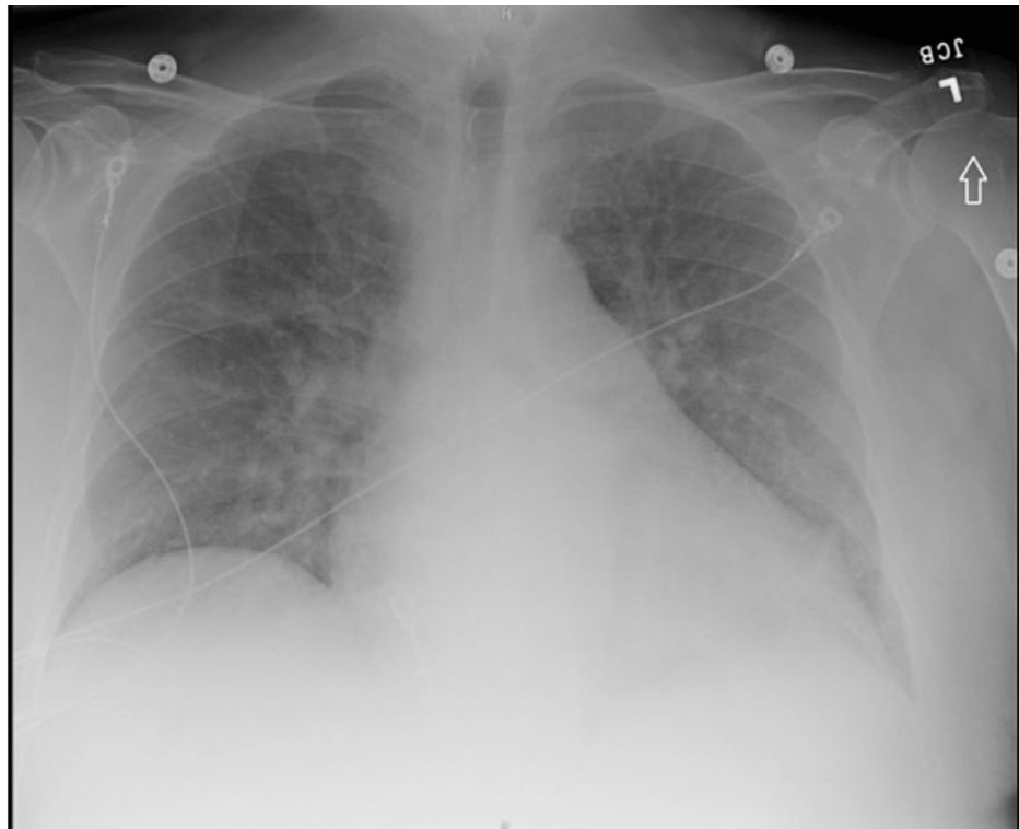
FIGURE 1: Chest radiograph showing cardiomegaly with pulmonary edema