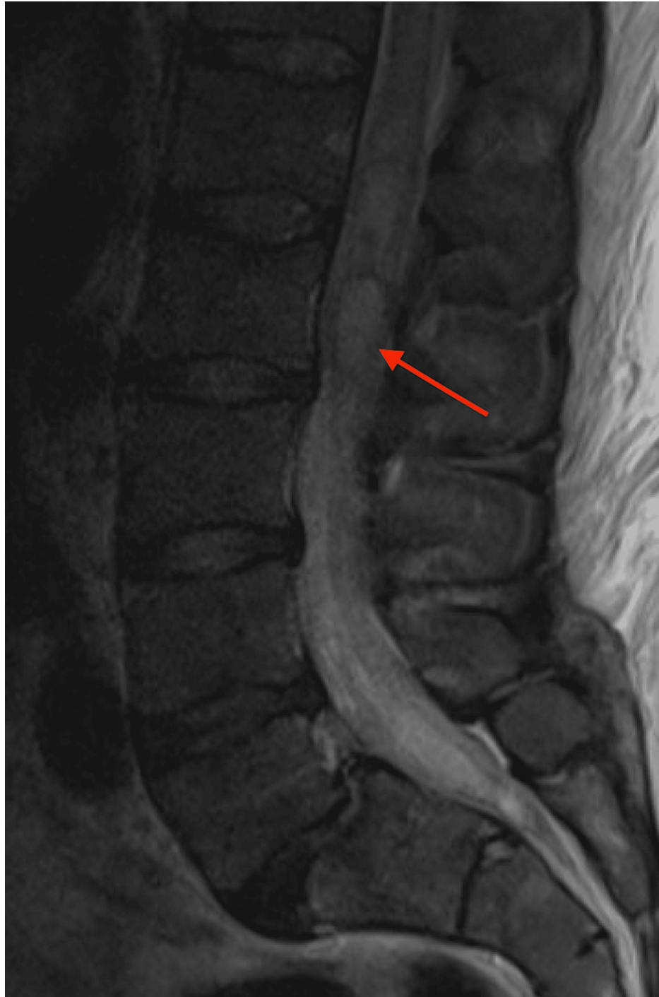
FIGURE 3: Sagittal lumbar spine MRI T2 image showing multilobulated, hyperintense mass associated at the level of L1-L3 measuring approximately 1.1 cm AP by 0.9 cm by 6.2 cm

The patient was admitted to the intensive care unit (ICU) for concern of possible hypertensive crisis as well as for ongoing monitoring and pain control. Upon admission to the ICU, he began to complain of right-sided leg numbness and weakness that progressed to left-sided leg numbness and weakness. Emergent lumbar spinal MRI was obtained (Figure 3) and illustrated an intramural mass at the level of L1-L3 with findings concerning possible hemorrhage.