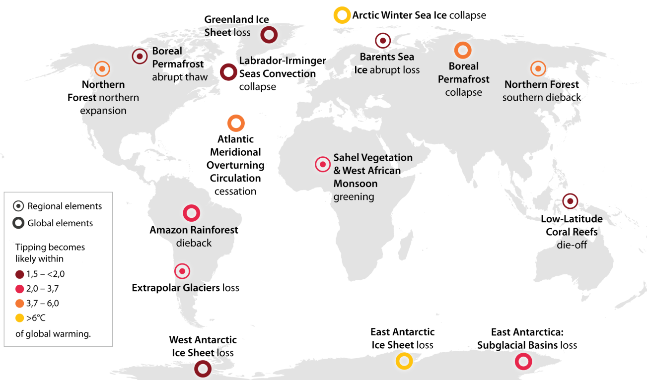
Fig. 1. A map of climate tipping elements, i.e., Earth system subdomains that determine the state of the climate system and are susceptible to dramatic change if global warming crosses threshold values corresponding to their tipping points. The ranges of global warming values where a tipping point is found for a specific tipping element are presented in colors (yellow for <2 °C, orange for 2 to 4 °C, and dark red for ≥4 °C). The map is derived from Armstrong McKay et al. (6) and printed with permission from the American Association for the Advancement of Science. See SI Appendix, Glossary for key definitions.

Crossing the tipping points will not only have environmental implications as their structure and functioning change (e.g., from stable to erratic regional rainfall) but is also likely to disrupt socio-economic and political systems that have developed with and are reliant on the stability of the Holocene (23). For instance, around 400 million people would directly suffer from a demise of tropical corals (51), and at 3 °C of global warming, over three billion people would be living in regions with health-threatening levels of heat (52). The same is true for the planetary boundaries, which, despite critique (reviewed in ref. 53), are considered precautionary "scientific assessments about what is safe, dangerous and unacceptable" (54, p. 83). Transgressing boundaries and undermining the functioning of biophysical systems already have severe multispecies justice implications for present and future