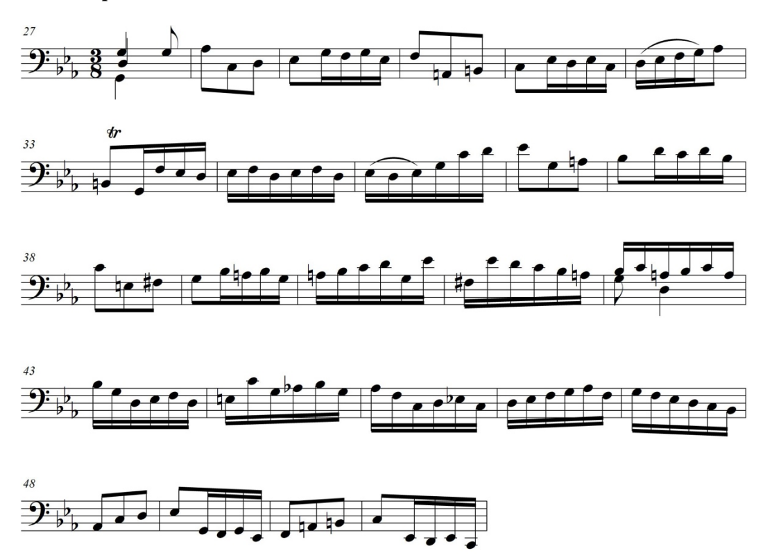
Example 7. J. S. Bach, Cello Suite in C minor, BWV 1011, Prélude, mm. 27-51.

The concept of measure grouping can be applied to music from different genres and periods to highlight specific musical aspects of the work. In this connection, we should compare two highly respected recordings with distinct musical choices in the fugue of J. S. Bach's fifth cello suite, where the second reading adds the element of hypermeasure—grouping two plus two measures—in order to emphasize the dance character of the section (see example 7).