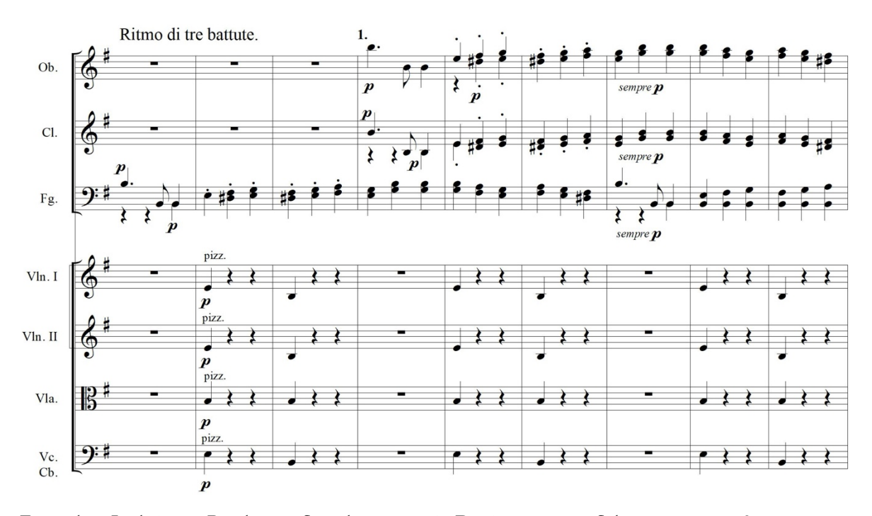
Example 5. Ludwig van Beethoven, Symphony no. 9 in D minor, op. 125, Scherzo, mm. 177-85.