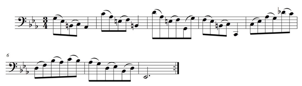
Example 3. J. S. Bach, Cello Suite no. 5 in C minor, BWV 1011, Sarabande.

Beethoven's Scherzo from the "Eroica" Symphony can be heard at the suggested link: https://www.youtube.com/watch?v=nJDQMyHbSko. Notice the ternary meter signature (2), while the measures are naturally grouped in 2 (example 4).