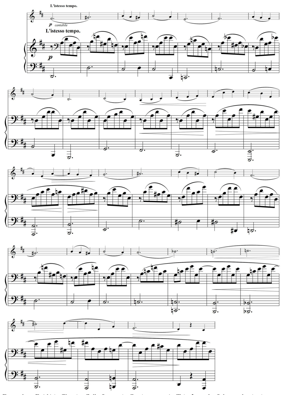
Example 9. Frédéric Chopin, Cello Sonata in G minor, op. 65, Trio from the Scherzo, beginning.