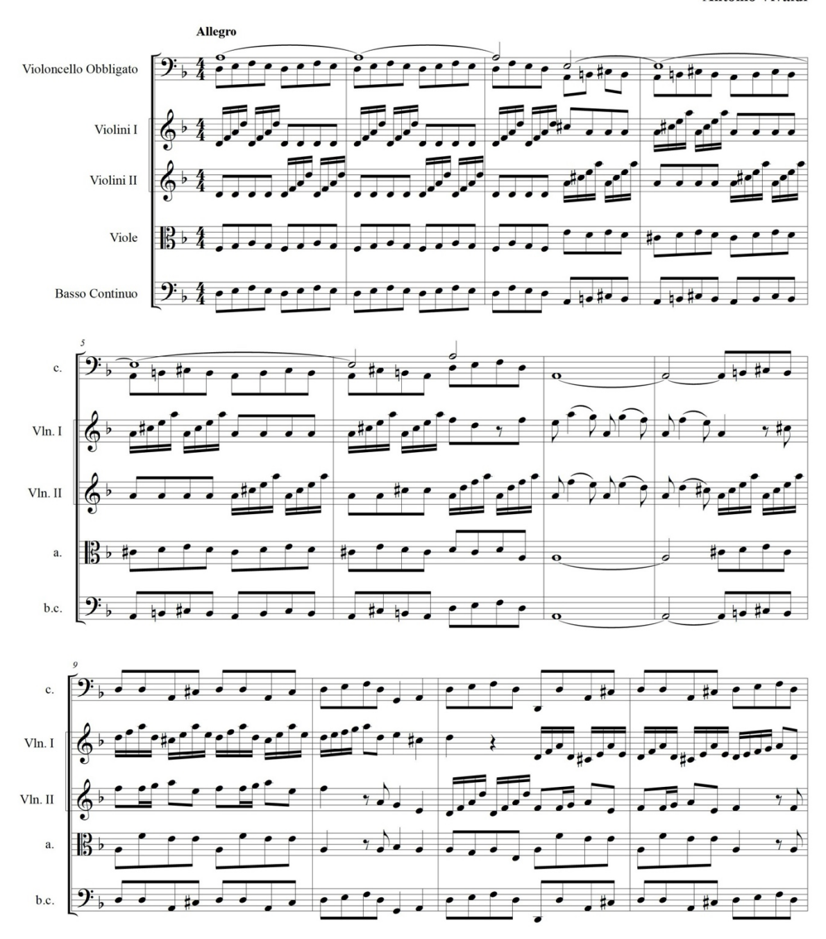
Example 6. Antonio Vivaldi, Cello Concerto in D minor, RV 407, mm. 1–12.

their choice of tempo, while cellist Davide Amadio and the ensemble Interpreti Veneziani emphasize four pulses per measure: https://www.youtube.com/watch?v=sOCamhrA-H4 (see example 6).