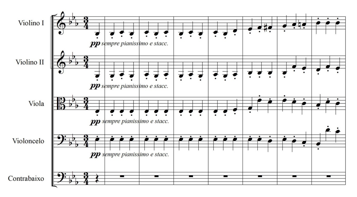
Example 4. Ludwig van Beethoven, Symphony no. 7 in Eb major, op. 55 ("Eroica"), Scherzo, mm. 1-7.

Beethoven's Scherzo from the "Eroica" Symphony can be heard at the suggested link: https://www.youtube.com/watch?v=nJDQMyHbSko. Notice the ternary meter signature (2), while the measures are naturally grouped in 2 (example 4).