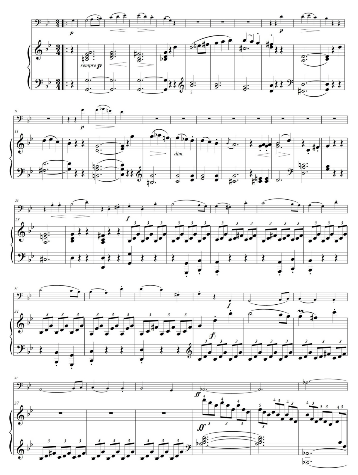
Example 12. Ludwig van Beethoven, Cello Sonata in G minor, op. 5, no. 2, I (beginning of Allegro section).