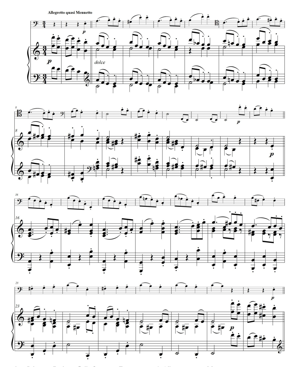
Example 2. Johannes Brahms, Cello Sonata in E minor, op. 38, Allegretto quasi Menuetto.