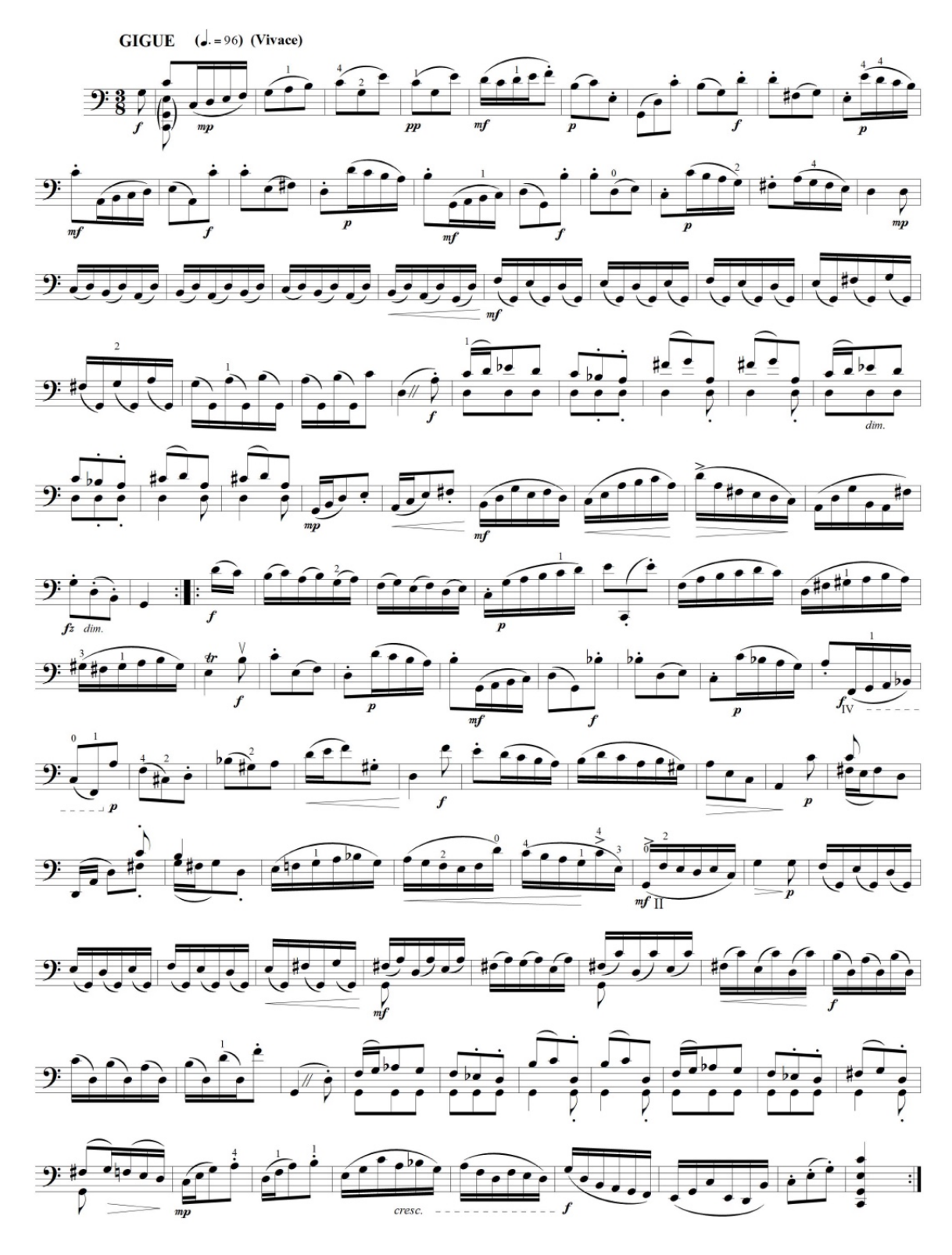
Example 11. J. S. Bach, Cello Suite no. 3 in C major, BWV 1009, Gigue.