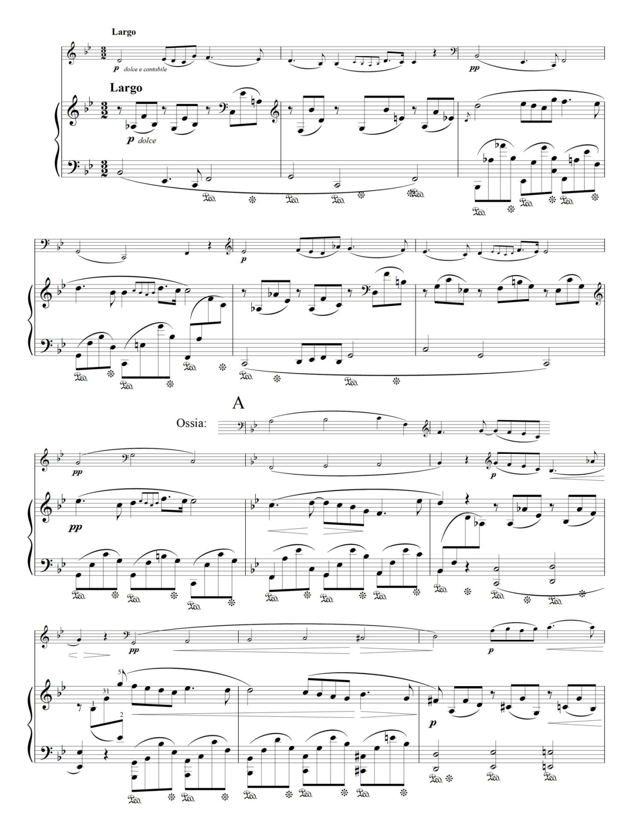
Example 10. Frédéric Chopin, Cello Sonata in G minor, op. 65, Largo, mm. 1-12.