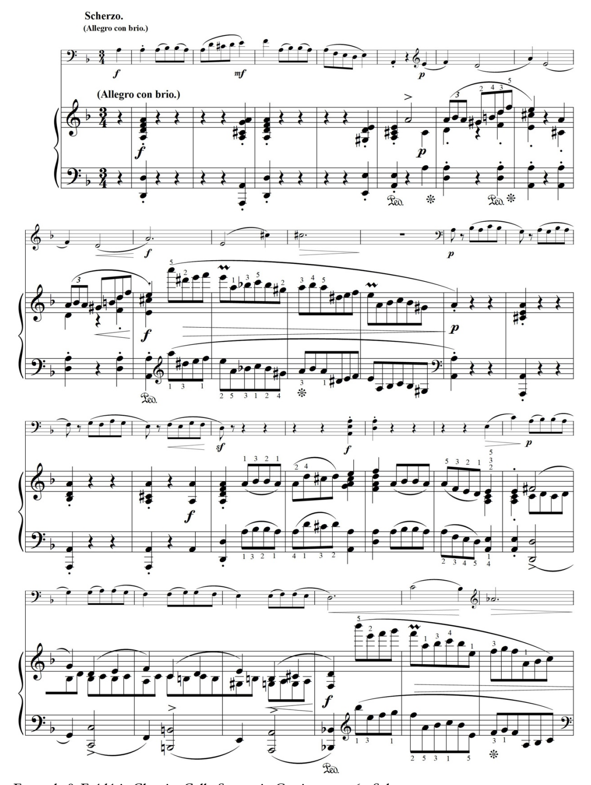
Example 8. Frédéric Chopin, Cello Sonata in G minor, op. 65, Scherzo, mm. 1–27.