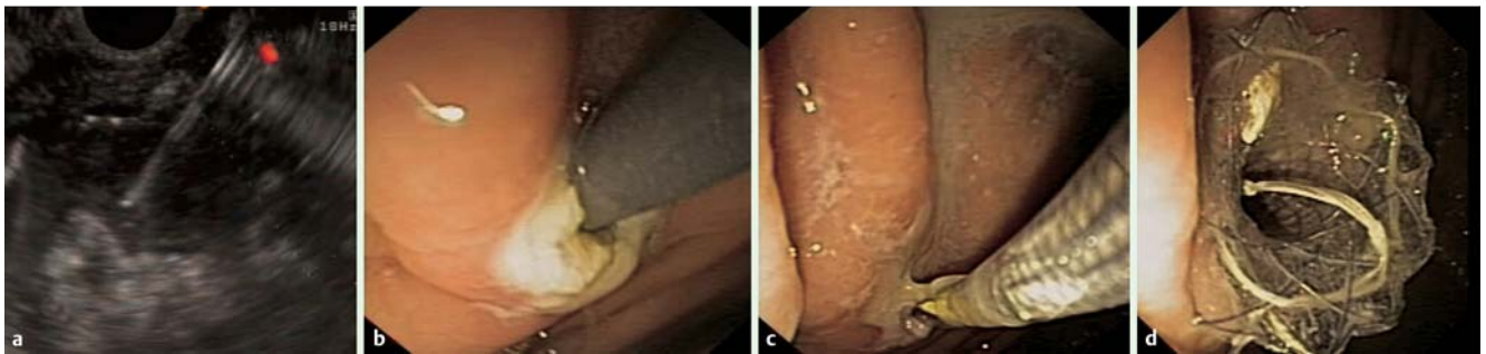
Fig. 1 a Endoscopic ultrasound-guided puncture in a 53-year-old man with a pancreatic pseudocyst. b Fistula created by pre-cut. c A covered self-expandable metal stent (CSEMS) on the guide wire. d The CSEMS observed from the stomach.

ear array echoendoscope (GF-UCT140; Olympus America Corp., Melville, New York, USA), a transgastric puncture with a 19-gauge needle (EUSN-19-T; Wilson-Cook Medical, Winston-Salem, North Carolina, USA) was made under EUS with Doppler guidance. A 0.035-inch wire (Jagwire, Microvasive Endoscopy, Boston Scientific, Natick, Massachusetts, USA) was positioned in the cavity, and a pre-cut was done to create a fistula. A new CSEMS (2 cm in length and 10 mm in diameter) with large flares (3 cm in diameter) at the extremities (Niti-S ComVi fully covered biliary stent, Taewoong Medical, Gyeonggi-do, Korea) was placed, with immediate drainage of pus (▶ Fig. 1, ▶ Fig. 2). The patient promptly recovered and no longer had fever. A CT scan after 10 days showed resolution of the pseudocyst. A gastroscopy conducted 3 months later showed that the CSEMS was correctly placed and patent. It was easily removed with a snare and the patient has not experienced any further problems.