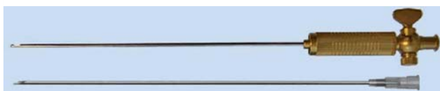
Fig. 2 The Verress needle.

This resulted in instantaneous outflow of air and an immediate and marked improvement in the patient's symptoms.