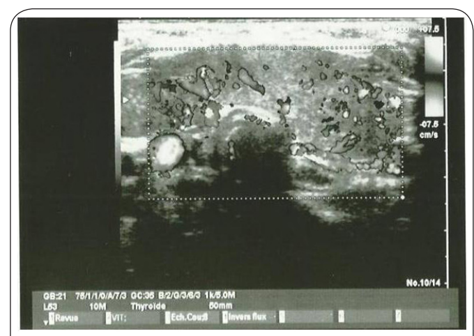
Figure 2. Enlargement and hypervascularisation of thyroid gland at doppler ultrasound examination.

Treatment was initiated as follows: pyridostigmine 240 mg/day, prednisolone 10 mg/day, with a reduction in the dose of carbimazole from 20 mg to 10 mg daily.