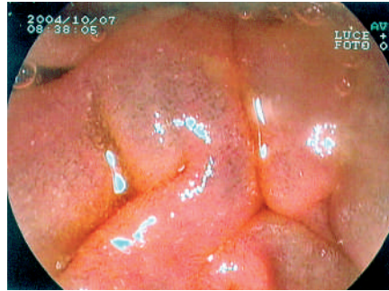
Figure 1 The papilla of Vater is obscured by the edematous duodenal folds.

An inflated balloon for stone extraction (Extractor XL 5147; Boston Scientific Microvasive, Nanterre, France) was used to flatten the folds, because they were too stiff to be moved or pulled aside in a sys-