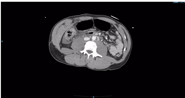
Figure 1. Duodenal Trauma – 1

The patient had uneventful postoperative course and was discharged at twelve postoperative day. I was then submitted to a Kehr removal after 1 month later.