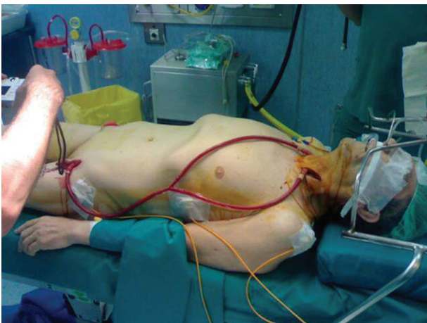
Fig. 1. The patient in hemodynamic laboratory. A view of the extra-anatomical femoro-bicarotid conduit.

The patient had an uneventful postoperative course. He was extubated on the first postoperative day. There were no cerebrovascular, renal or respiratory complications. No