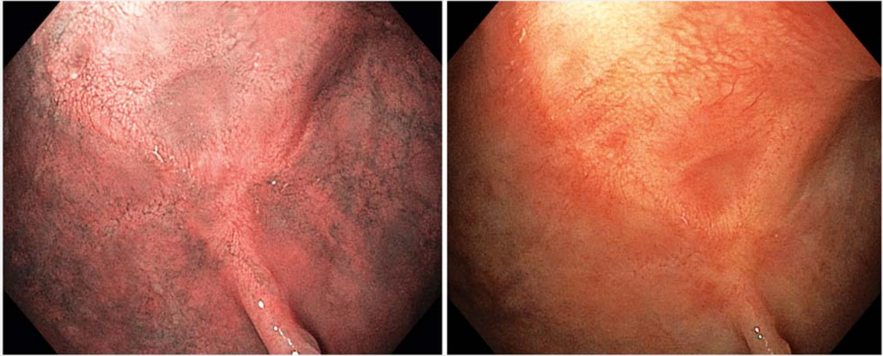
► Fig. 2 Endoscopic views showing no evidence of recurrence at the 12-month follow-up.