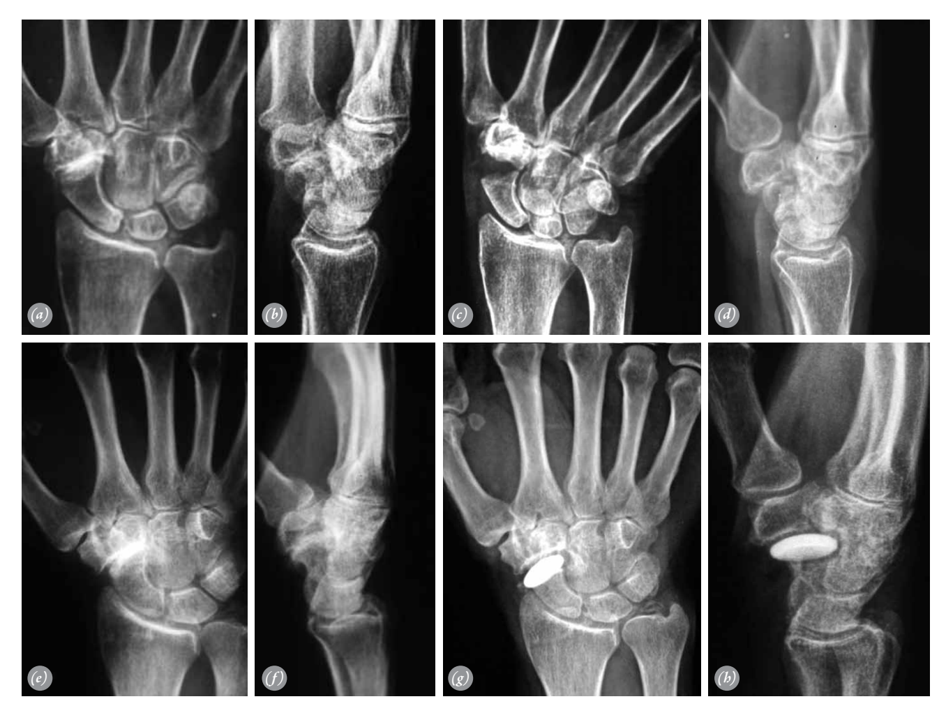
Fig. 2. (a) Preoperative posteroanterior and (b) lateral views of a patient treated with resection arthroplasty only. (c) The articular surfaces of the scaphoid and lunate are well preserved. (d) However, the DISI deformity is still obvious after 6 years. (e) Preoperative posteroanterior and (f) lateral views of a patient treated with resection and STPI. (g) The implant is well positioned (h) and there is still no DISI deformity after 34 months.