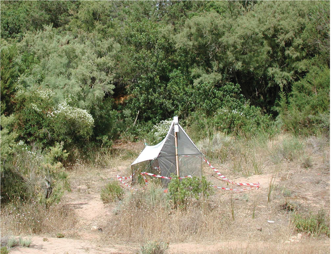
FIGURE 11. The Malaise trap on the shore of Lake Baratz in 2002.