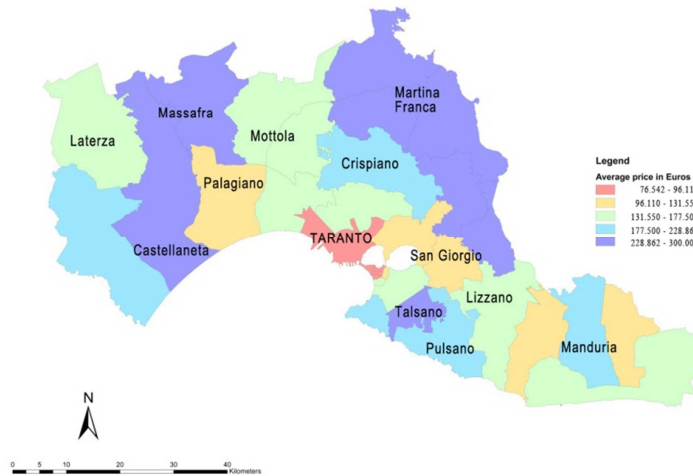
Fig. 2. Spatial distribution of average asking prices aggregated by zoning in the study area.

The most relevant variables, according to the aim of this study, are ROOMS, BATH, GAR.GA, BCH,TE and those which refer to transport conditions: LTI, TRAIN and ACC_ACTIVE.