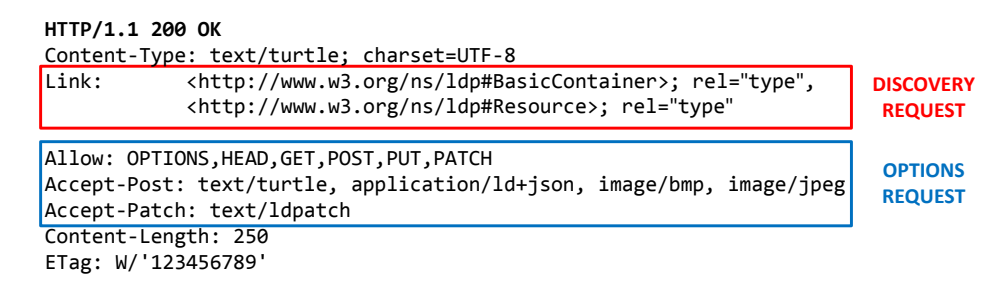
Fig. 2: Example1. HTTP GET response (payload data not included)

As defined in Table 3, title and rt query parameters are obtained from the Slug and Link HTTP header fields, respectively. If the Link header is not defined, ldp:Resource is used as default value of rt. The HTTP response will contain the Location HTTP header corresponding to the Location-Path CoAP response option.