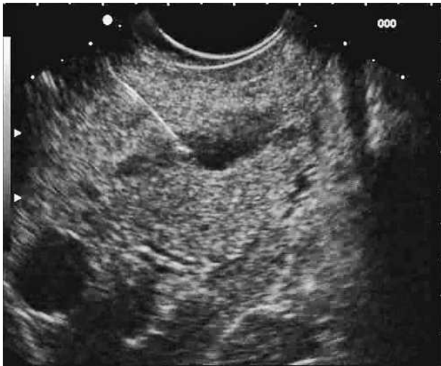
Fig. 1 Common bile duct punctured under endoscopic ultrasound guidance before placement of the guide wire.

was unsuccessful. An endoscopic ultrasound (EUS)-guided rendezvous drainage of the bile duct was performed (FG 36UX echoendoscope; Pentax GmbH, Hamburg, Germany), puncturing the common bile duct with a 22G needle (EUSN 1; Wilson–Cook, Winston Salem, NC, USA) (● Fig. 1). A 0.018-inch guide wire (Pathfinder; Boston Scientific, Natick, MA, USA) was passed through the needle until it reached the duodenum (● Fig. 2). Using a duodenoscope (ED 3480TK; Pentax), the wire was captured with a snare (● Fig. 3) and a 2-mm sphincterotome was placed over the wire (● Fig. 4). After sphincterotomy a 7-Fr pigtail nasobiliary drain was placed for drainage of the bile ducts.