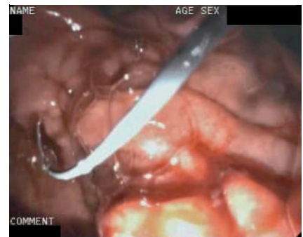
Fig. 3 Guide wire inside the duodenum after snare capture.