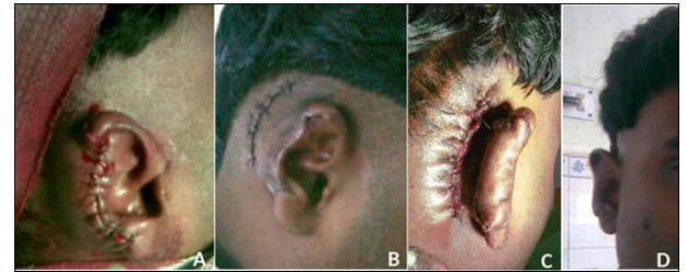
Fig 3: Post auricular flap for acquired middle third defect of right external auricle A) Flap attachment after first stage B) Flap delay C) and D) After second stage-flap division and in setting.