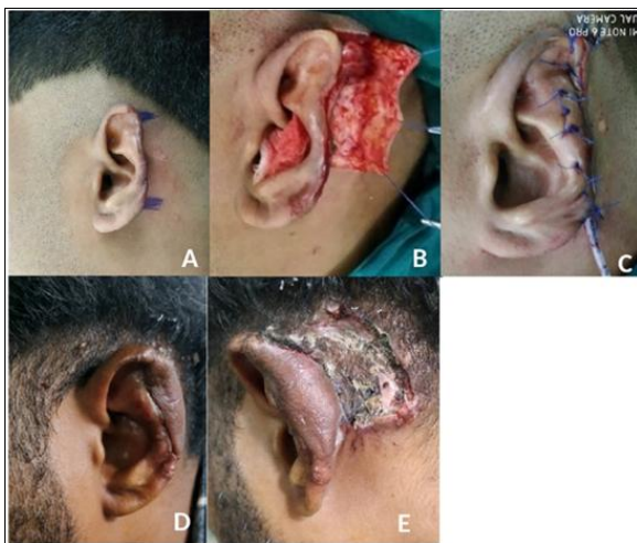
Fig 1: Post auricular flap for acquired middle third defect of external auricle A) Flap design B) Flap elevation C) Flap attachment after first stage D) and E) After second stage-flap division and in setting.

14 patients had defect in the right ear and 10 patients had left ear defect. The time interval between the injury and reconstruction varied between 10 -21 days. 8 patients had upper third and 16 patients had middle third defects of the external ear. All human bite patients were taken up for reconstruction after adequate control of infection. The defects varied in size between 2.5cm and 3.5 cm and all these were covered with post auricular flaps (Figures. 1, 2, 3, 4).