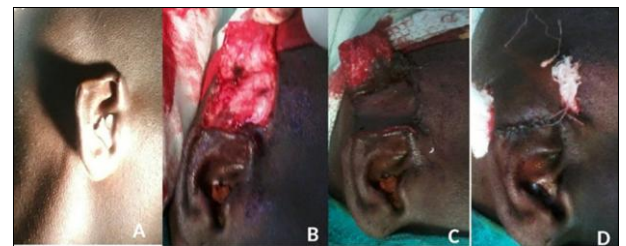
Fig 4: Post auricular flap for acquired upper third defect of right external auricle A) Defect B) Flap elevation C) Skin grafting for the secondary raw area D) Flap attachment.

Two patients had hematoma (8.33%), one patient had marginal flap necrosis (4.16%), three patients had partial loss of skin graft (12.5%) and three patients had infection (12.5%) (Table 2).