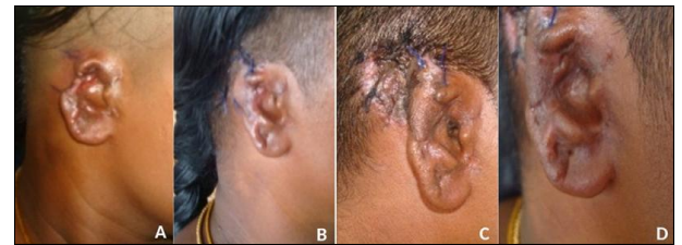
Fig 2: Post auricular flap for acquired upper third defect of external auricle in a female A) Flap design B) Flap attachment after first stage C) and D) After second stage-flap division and in setting.