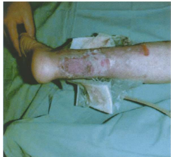
Figure 5—Day 5 after surgery. Note that the graft has 'taken'.