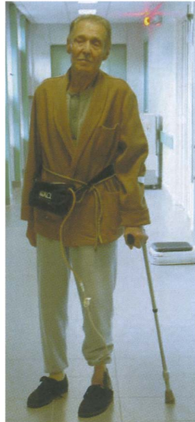
Figure 4—The patient is encouraged to walk immediately after recovery from anaesthesia.