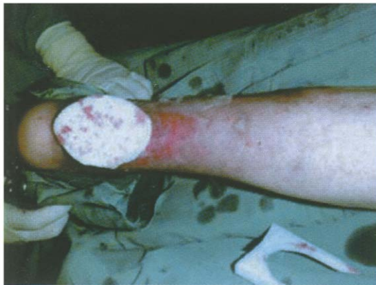
Figure 2—The spongy pad is applied to the graft.

The machine, attached to a belt, is easily portable and does not impede the patient's daily activities (Fig. 4). After 5 days the dressing is removed. At this stage the graft has usually taken (Fig. 5). Within 14 days the graft is usually stable and perfectly adherent to the surrounding skin.