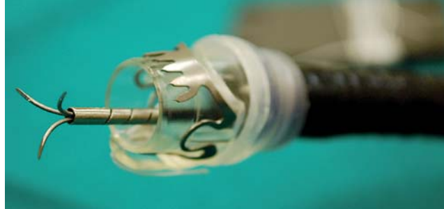
Fig. 3 The over-the-scope clipping system with the anchor catheter.