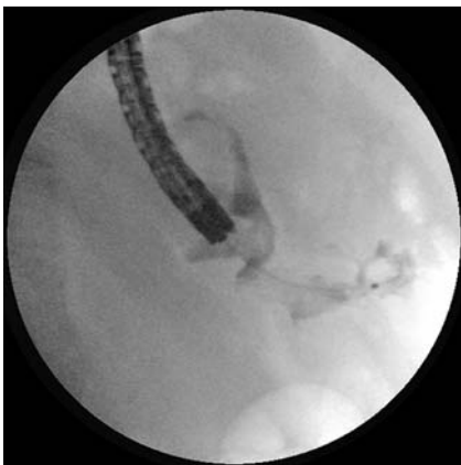
Fig. 2 X-ray examination showing the extravasation of contrast medium.