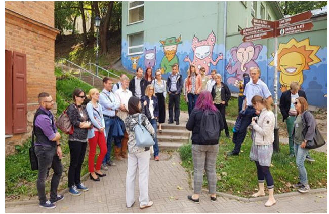
A group of participants enjoying a walk in Tartu