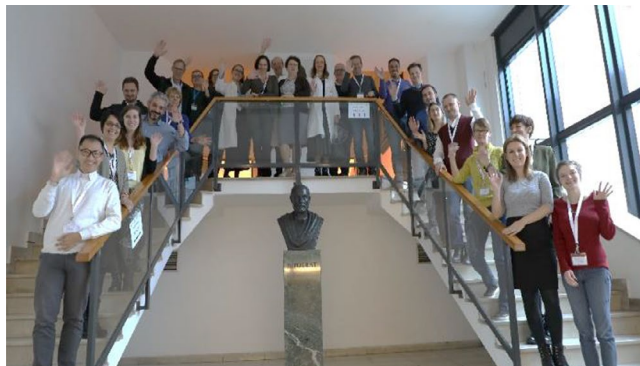
The attendees and EAA faculty members of the Winter School