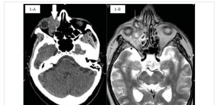
Figure 1: A: Non enhanced axial CT shows bone erosion of the papyracea lamina of ethmoid bone. B: Axial T2 weighted sequence shows an extraconal and intraconal mass (white arrows) in the right orbit, with non-homogeneous hyperintensity and irregular margins. The lesion involves the nasolacrimal canal, the papyracea lamina and the anterior ethmoid cells.

MRI scan substantiated a T2 mildly hypointense, T1 isointense mass with erosion of the inferior orbital wall.