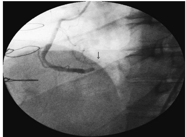
FIGURE 1. Postoperative coronary angiography: occlusion of the RCA at the level of the inferior end of the band, at the level of the posteroseptal commissure of the tricuspid valve ( arrow ).

the pump was stopped with good hemodynamics without inotropes. Peak enzymatic release was 193 creatine kinase-MB UI/L. The patient was extubated on the first postoperative day, and the postoperative course was uneventful. The echocardiogram before discharge showed no mitral or tricuspid regurgitation, ejection fraction lower than the preoperative value (50%), and mild inferior hypokinesia. The coronary angiography, performed before the patient's discharge, showed complete RCA occlusion just before the posteromedial tricuspid commissure (Figure 1) and a widely patent saphenous vein graft. The level of RCA occlusion was immediately before the crux cordis.