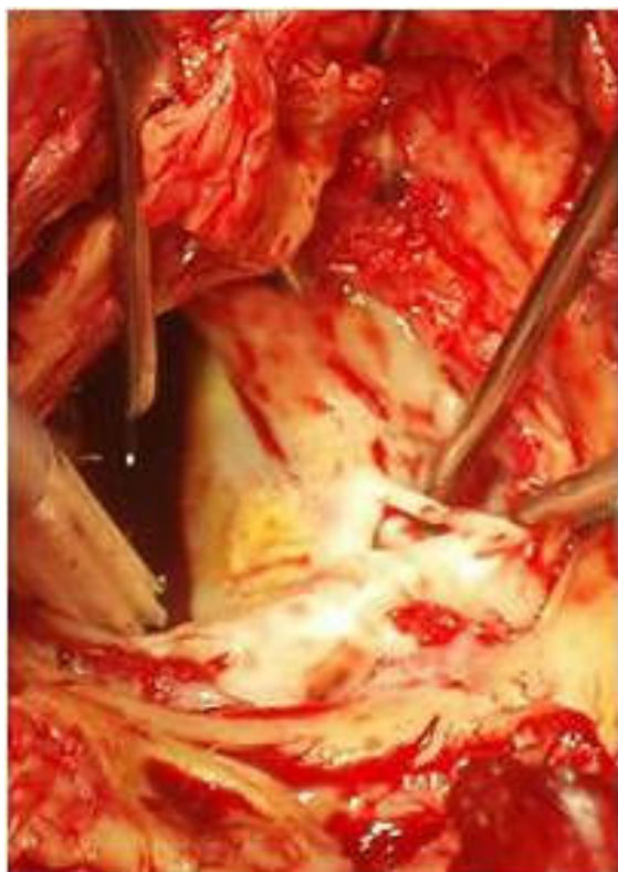
Figure 2 Surgical view of an aortic peri-annular abscess.

Some patients develop arrhythmias that can further lead to hemodynamic instability [12]. Abscesses are more common in patients with prosthetic versus native valves, reported in 40% versus 19%, respectively [6]. Roughly 22% of patients with aortic valve IE have a periannular abscess, mainly due to coagulase-negative staphylococcal infections [6,13].